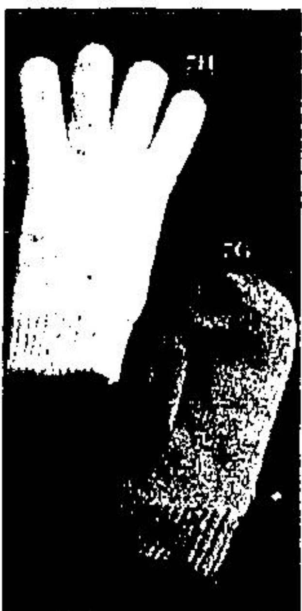
Mitts and gloves in nine colours!

(7F) 708 — Clip-together cowhide mitts with acrylic knit lining; boa trim. Dark brown or mushroom; one size. (DEPT. 701)