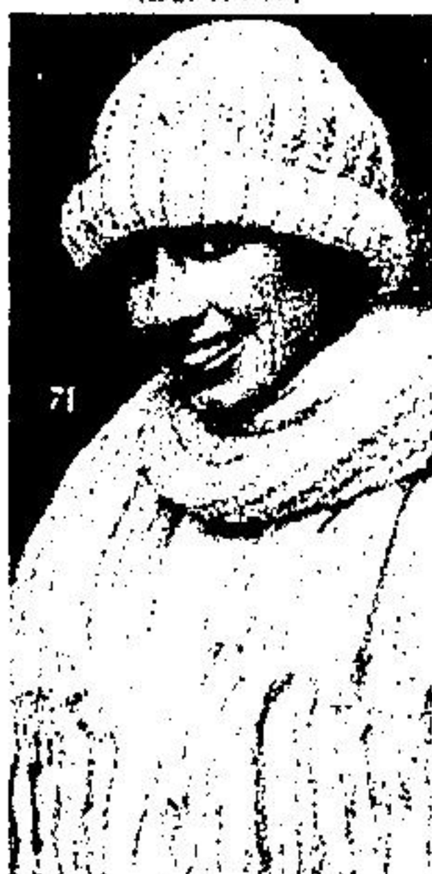
Woolies to go wild over