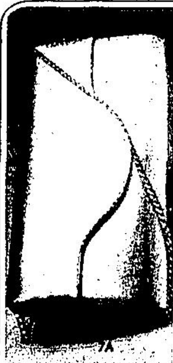
The disco bag — gift to delight Eaton price, each