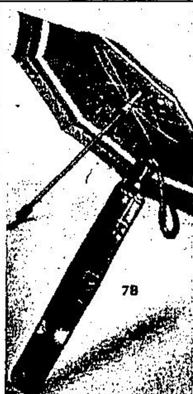
Rainy-day buy . . . fold-up umbrellas