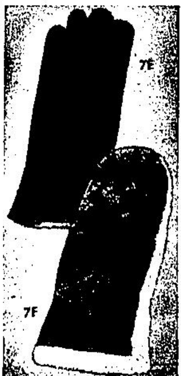
Gloves and mitts — split cowhide