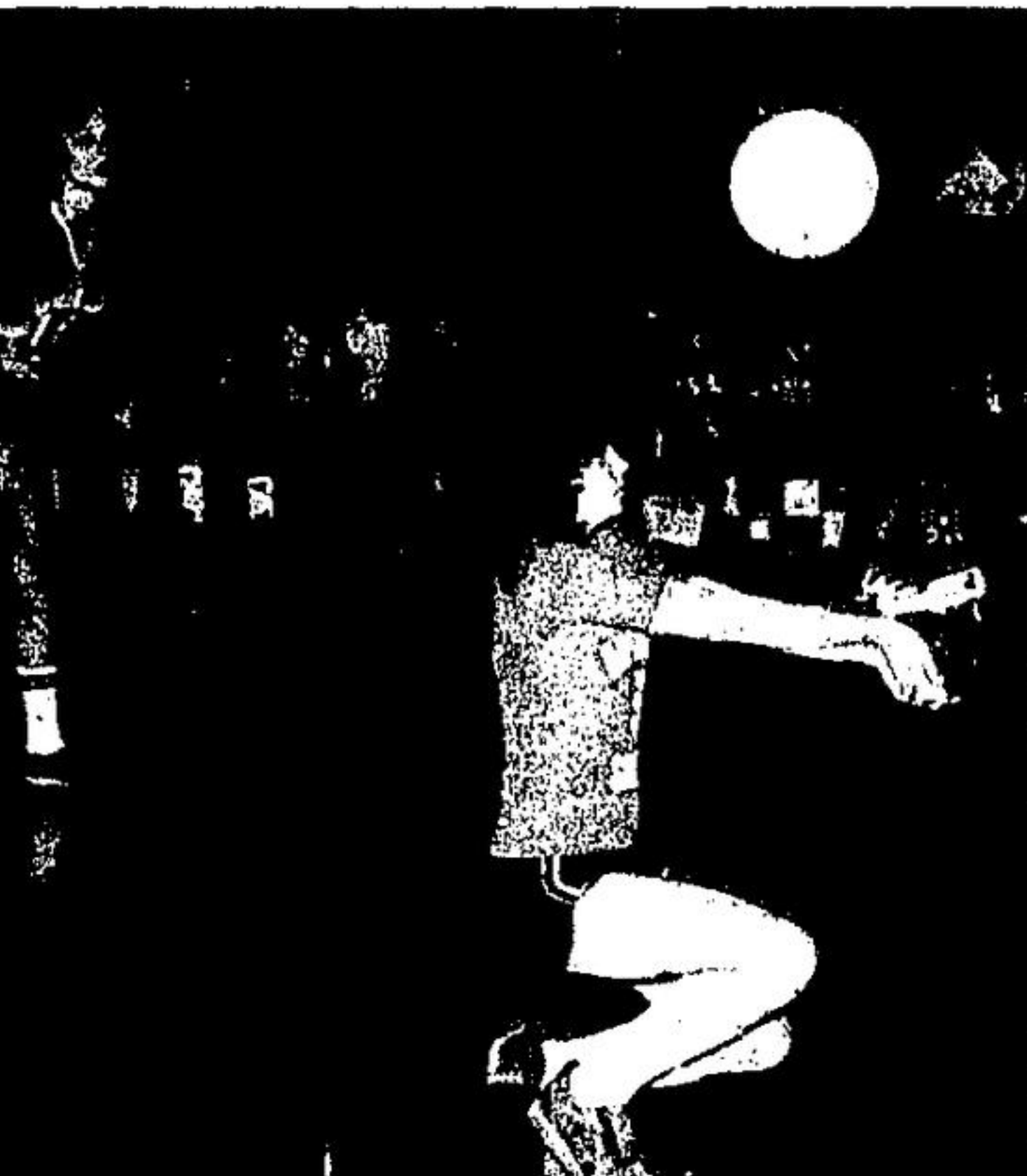
Ready and Set! McKenzie-Smith's girls' Volleyball team watches anxiously as another team member sets up the ball during the North Halton championships. The Acton school finished the competition with a five and five record for fourth place.