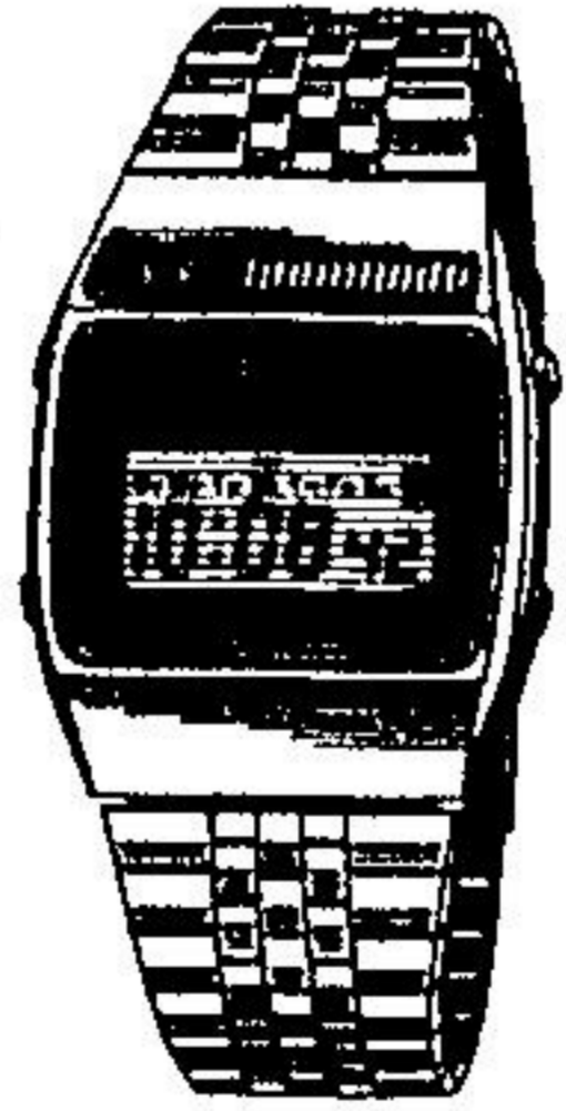
No. F808M—$335.00. LC Digital Quartz Alarm Chronograph. Electronic alarm bell. Records hours, minutes, seconds and 1/10 second. Yellow top/stainless steel back. Also available in stainless.