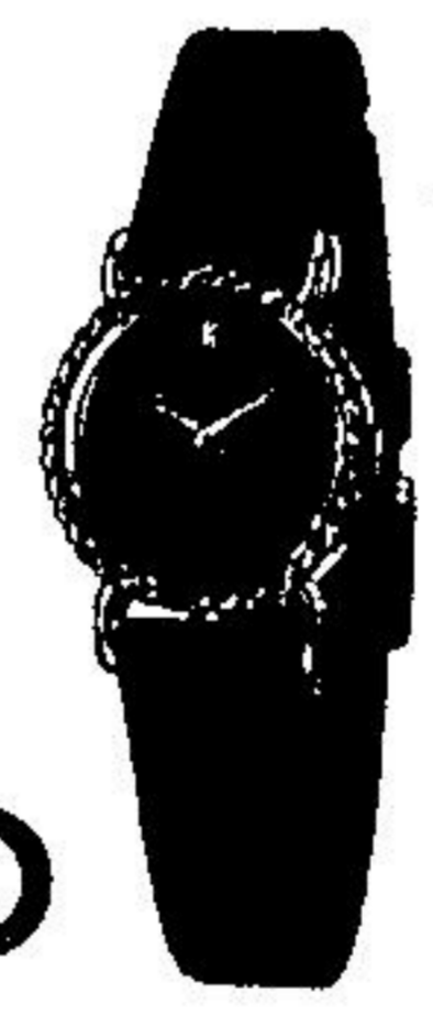
No. YL185—$195.00. Ladies' thin dress quartz. Yellow top, stainless steel back, black dial.