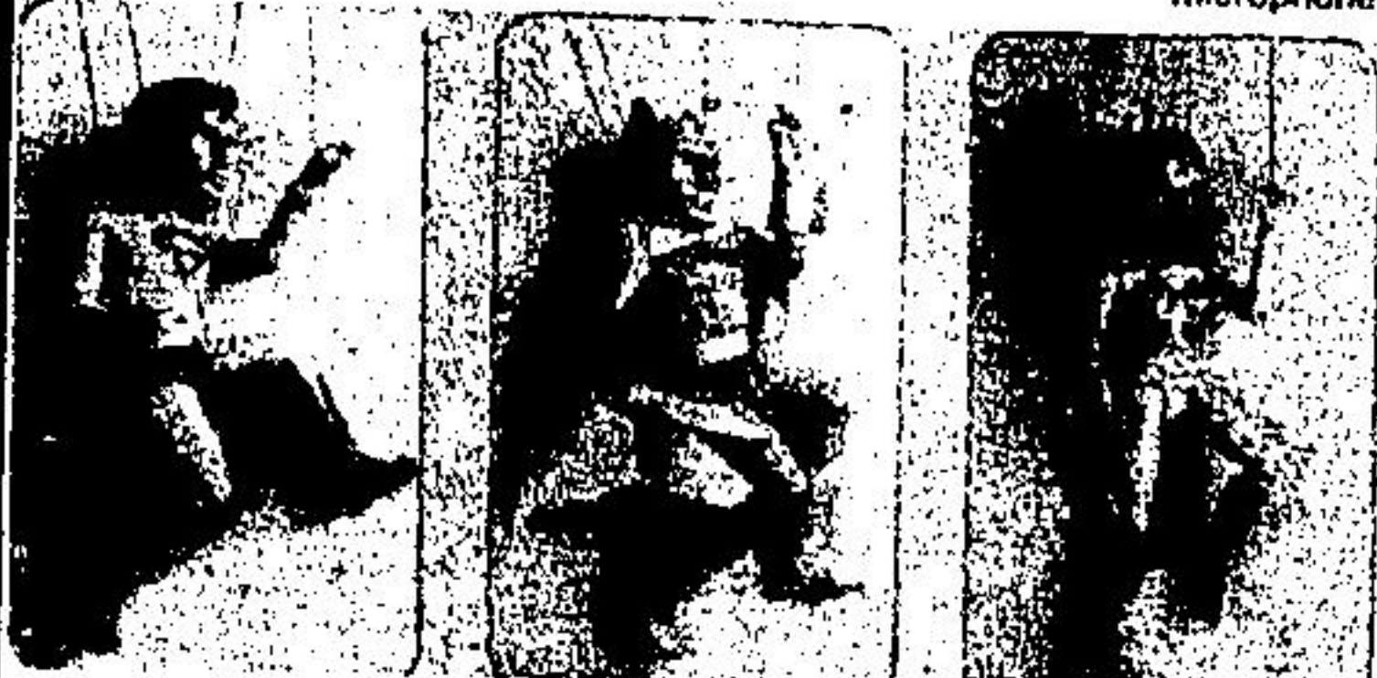
The first string puppet that is so easy to operate even a four year old can do it. Characters come alive in a child's hands. No assembly required. Almost tangle proof. 11 1/2" high and are molded in sturdy plastic with cloth costumes.