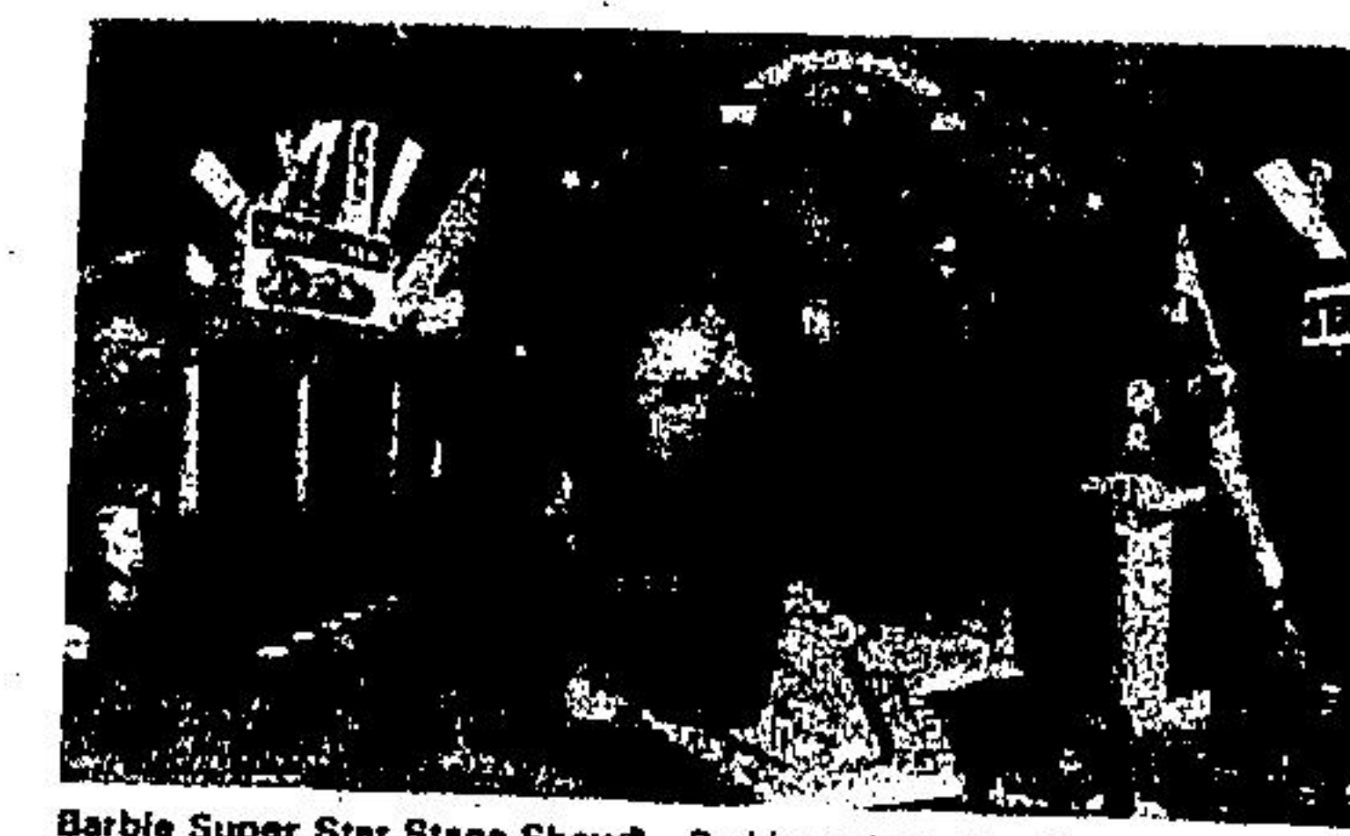
Barbie Super Star Stage Show by Mattel. Barbie and her friends put on a stage show. Clip dolls to movable track on stage. Includes podium, trophy, crown, mikes, guitar and record (English/French). Operates by remote control and uses 2 'D' batteries (not included). For use with fashion dolls up to 12 1/2" tall. About 38 x 18 x 16" high. . . . $9.99