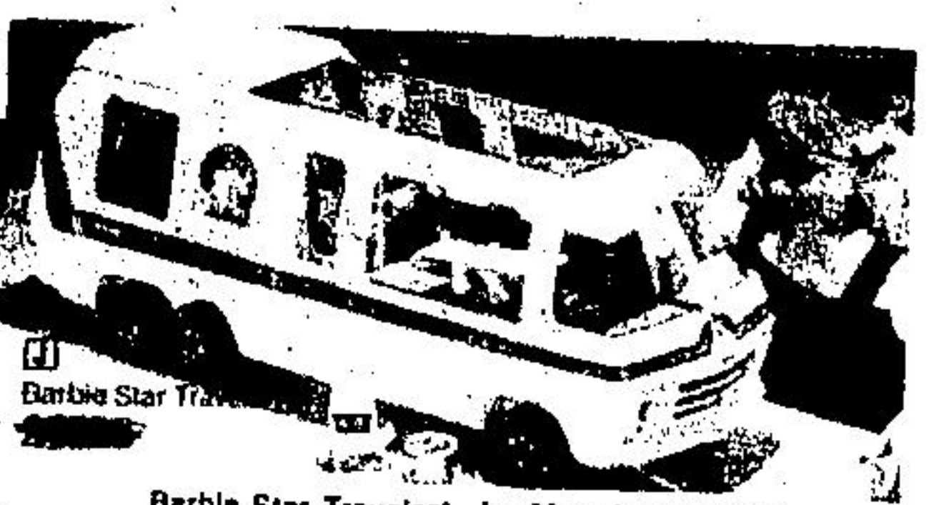
Barbie Star Traveler by Mattel. Real GMC Motor Home look-alike — inside and outside! 3 feet long with swivel seats, play stove, sink, dishes, vanity, cabinet chair, 2 tables, hibachi and much more! . . . $28.88