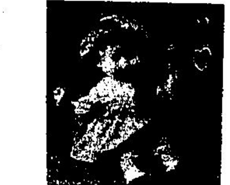
Kiss Me Doll by Irwin ... the doll that really kisses! Squeeze her hand, put baby's lips against cheek and release hold. Pull doll away from cheek and she kisses you. 16" tall. . . . $7.97