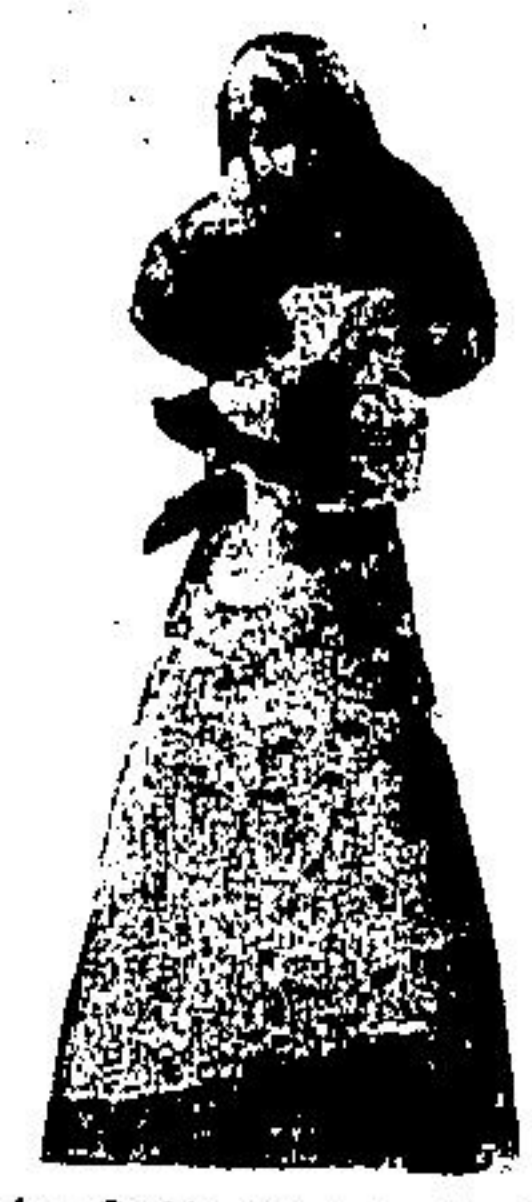
Kissing Barbie. Press her back and her head moves up and forward and makes a kissing noise. 'Lipstick' applicator included. Plastic. . . . $8.99