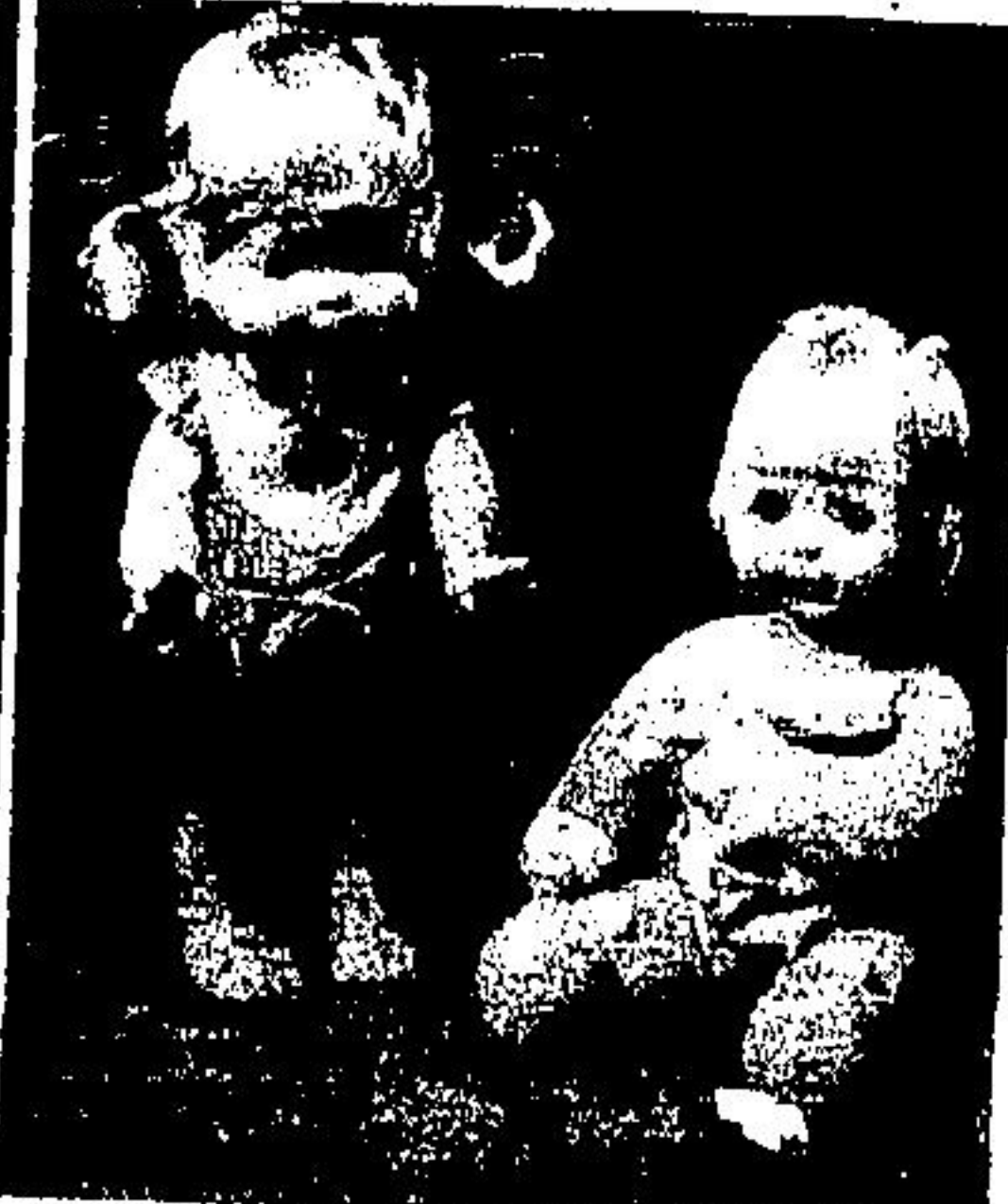
Whoopsie Doll by Ideal. The doll with the hair that goes up in the air! Squeeze her tummy... her pony-tails fly right up and she makes a 'whoopsie' sound. 13" tall. No batt. needed. . . . $18.88