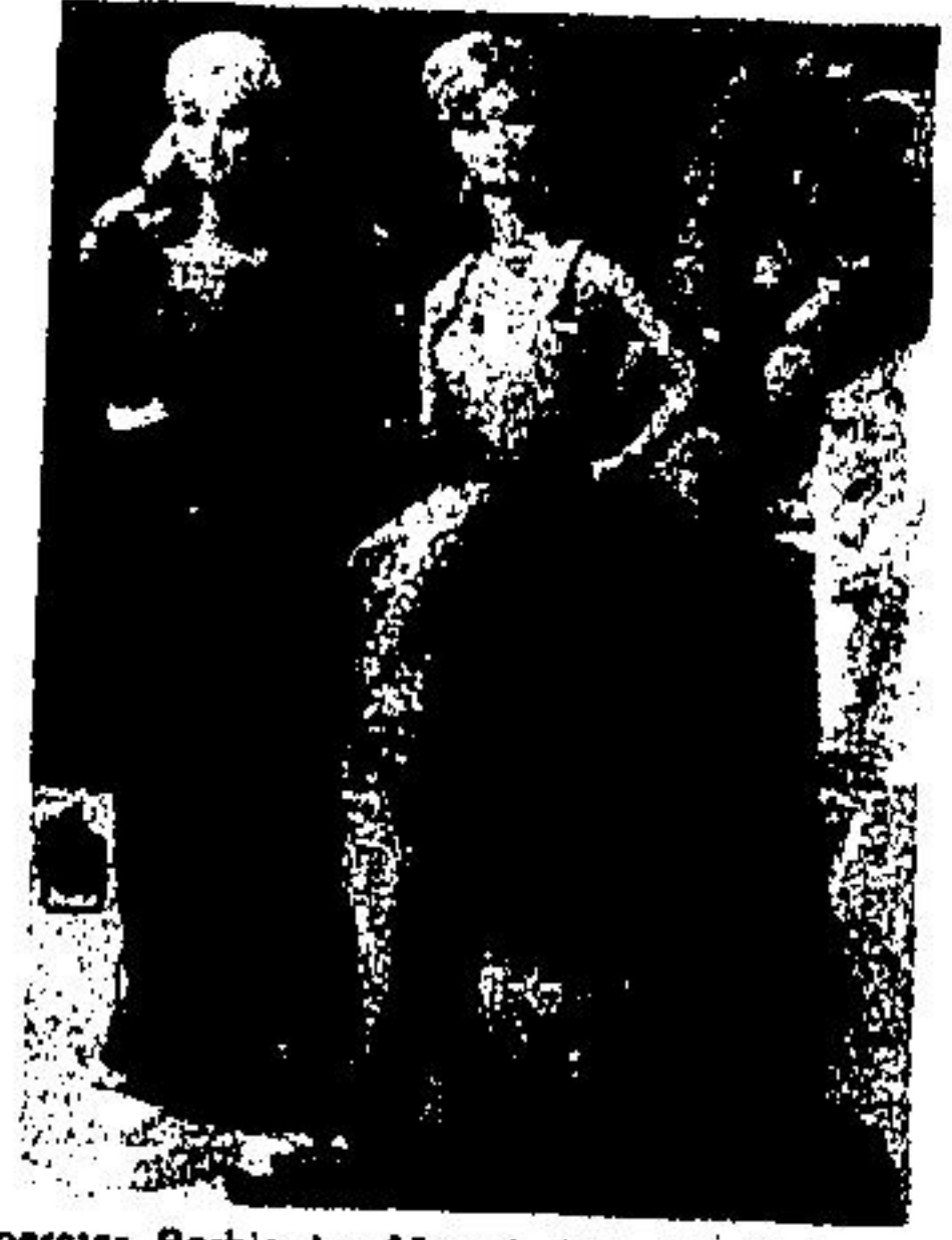
Superstar Barbie by Mattel. Beautiful Barbie has gorgeous sunstroked hair. Arms bend at elbow. Fashionable pink satin gown and earrings. . . . $8.77