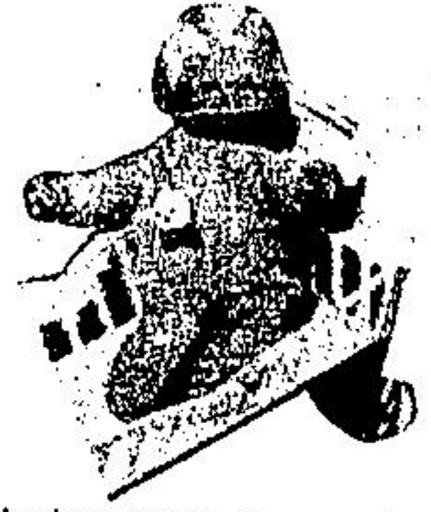
Newborn Thumbelina — pull a string and she wriggles, twists. Plastic Cradle Not Included. . . . $4.99