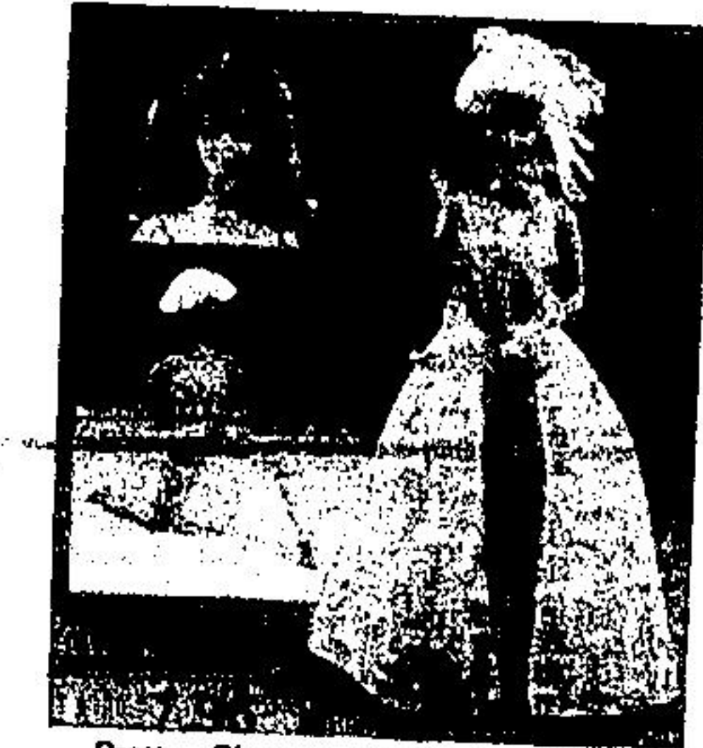
Pretty Changes Barbie by Mattel. Change her looks again and again with different hairpieces, hats, earrings and clothes. Loaded with play value. . . . $7.98