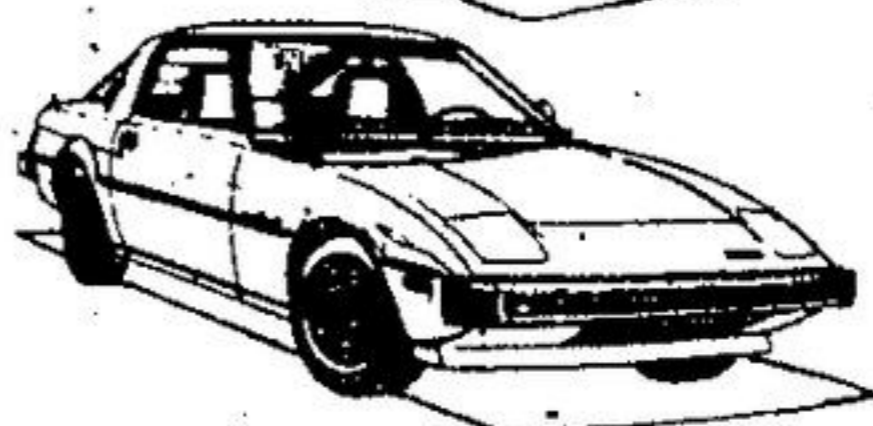
1980 GLC Hatchback priced from $4290