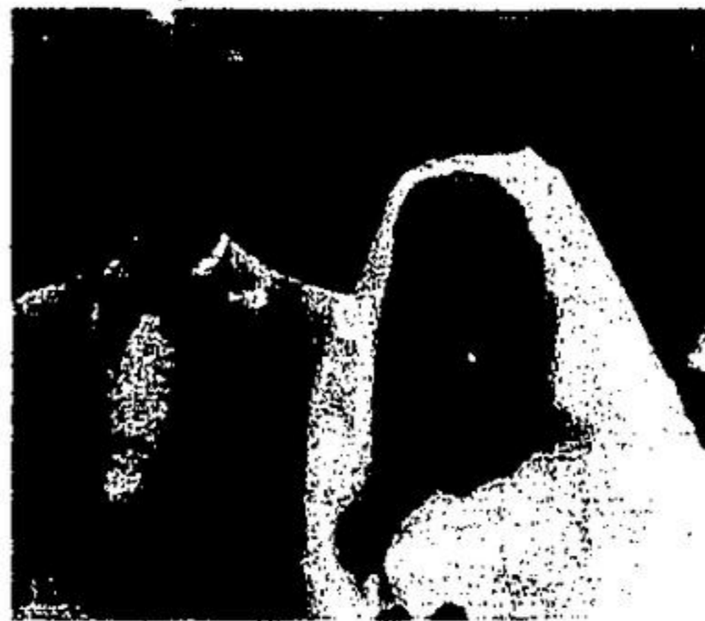
Married at Trinity United Church, Acton.