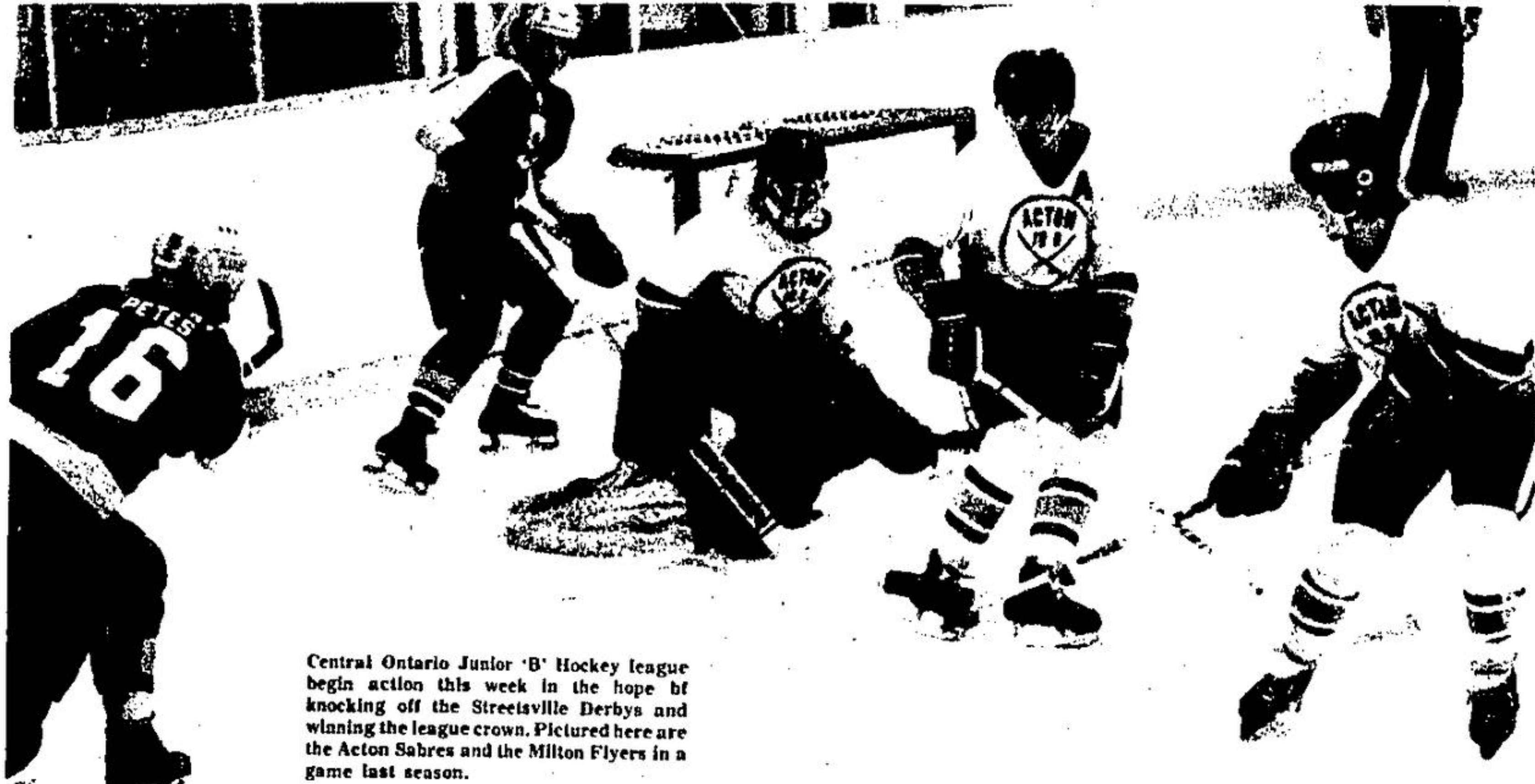
Central Ontario Junior 'B' Hockey league begin action this week in the hope of knocking off the Streetsville Derbys and winning the league crown. Pictured here are the Acton Sabres and the Milton Flyers in a game last season.

Despite the players Blades will lose this year they must still be considered a contender. Eight players with Junior 'B' experience will be in the line-up including six