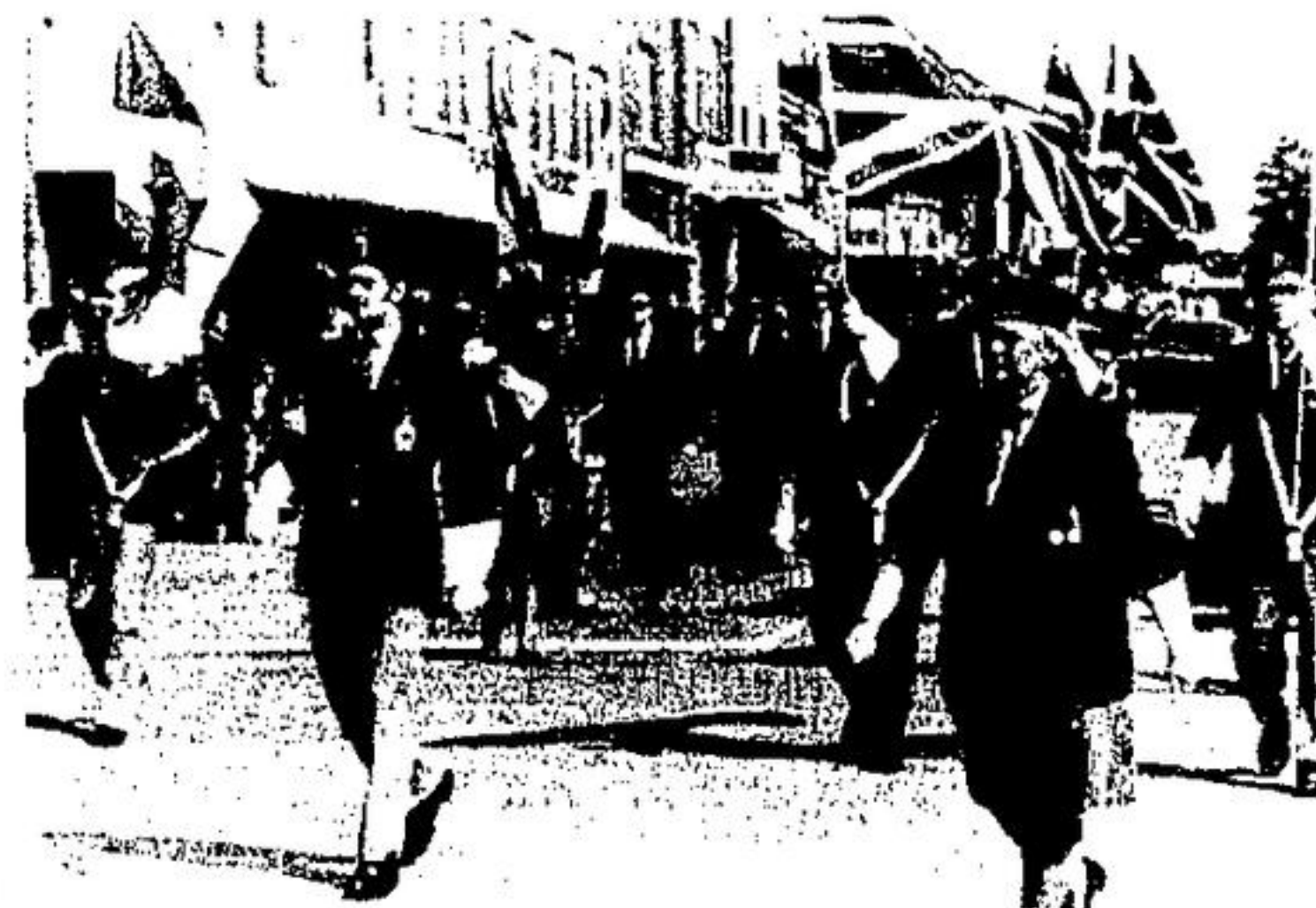
Royal Canadian Legion Branch 197 veterans were in full color during the parade Saturday.