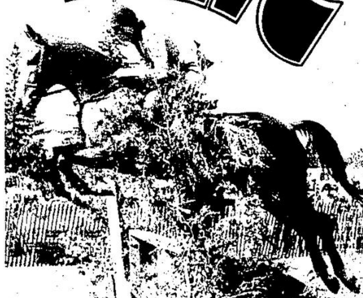
Conduis ridden by Jane Casselman shows excellent form over fences during Saturday's fall fair jumping classes.