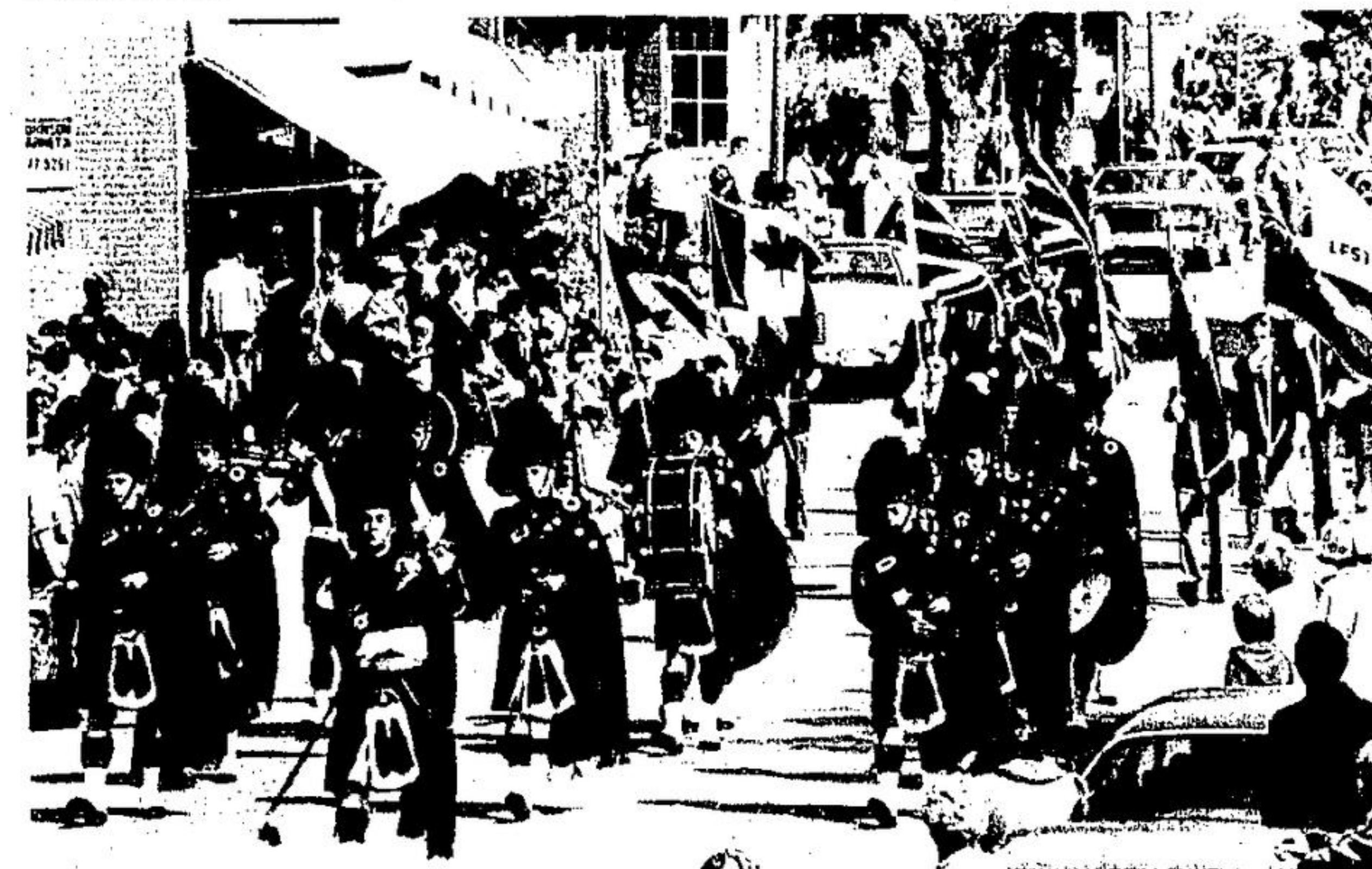
The Georgetown Pipe Band brought the sound of the highlands into the midsts of fall fair activities.