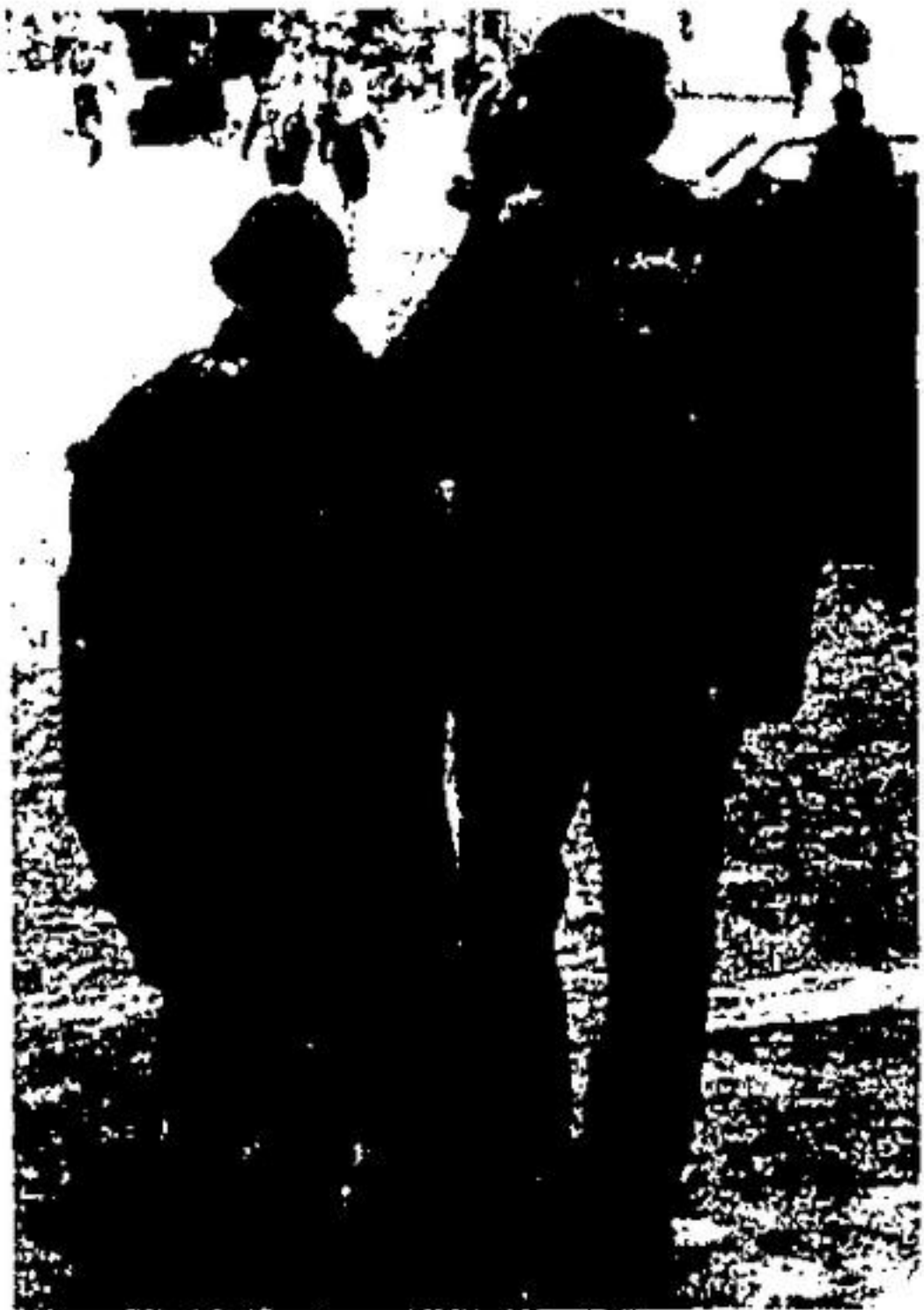
A husband and wife Scouting team prepare to leave Blue Springs after a weekend of fun and renewing old acquaintances at the Gilwell reunion. All of the 1,790 Scouters who attended the annual event have completed their Gilwell Training. The oldest Gilwell Scouter at this year's reunion completed his course in 1922.