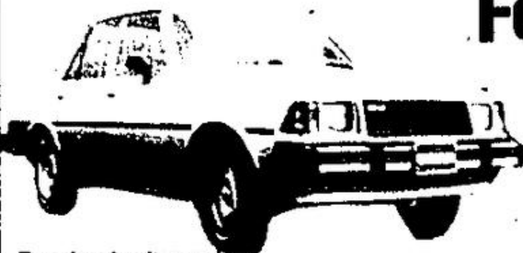
Two door hardtop and automatic transmission models available at additional cost.

The 626 four door sedan features 2 litre four cylinder engine, five speed standard transmission, AM/FM stereo radio, power assisted front disc brakes, rear folding seat, radial ply tires, style road wheels, electric rear defroster, tinted glass, clock, cloth interior, remote trunk release, intermittent wipers, bodyside mouldings and more.