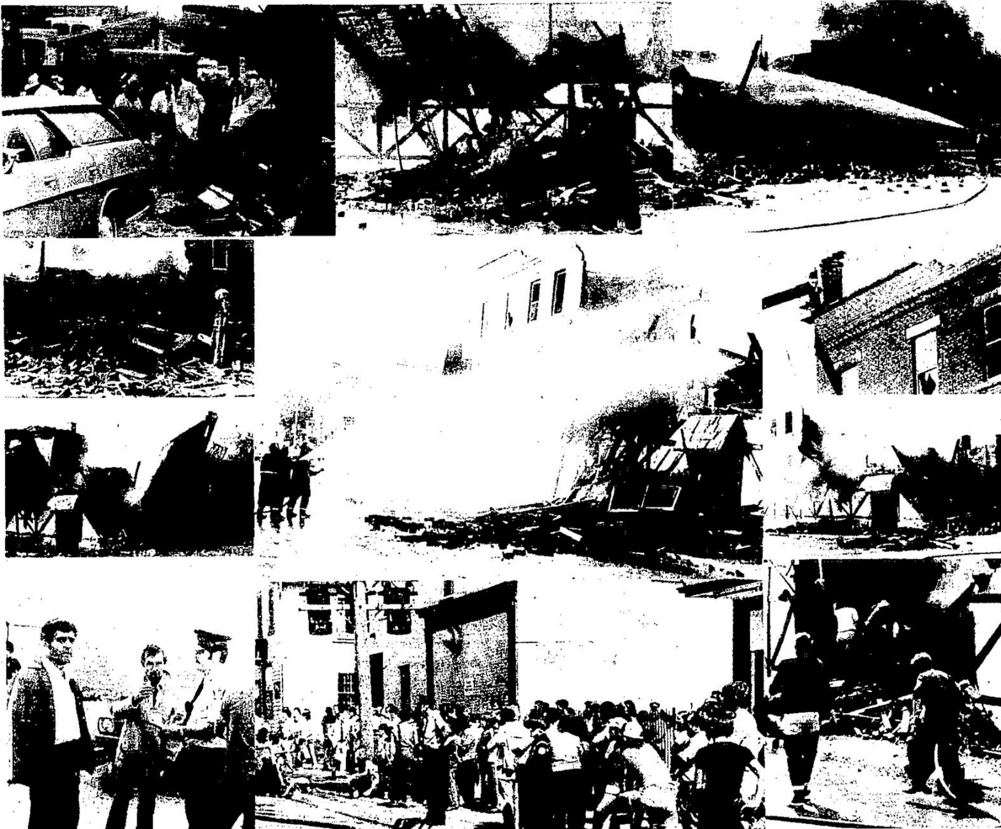
Firefighters battle Dominion Hotel blaze Sunday