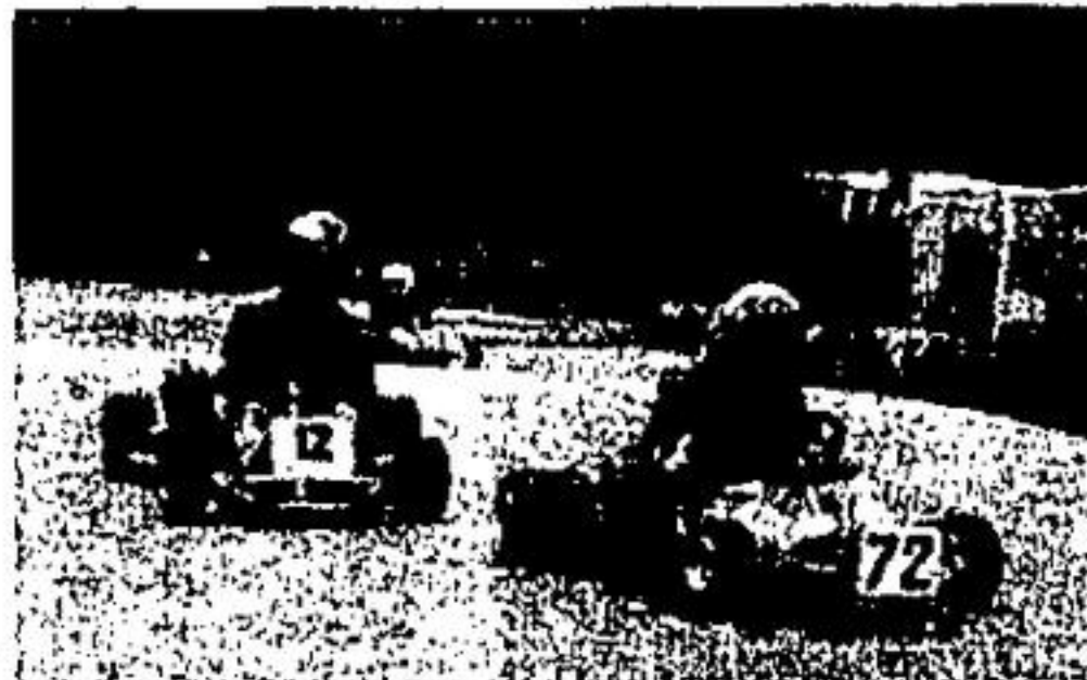
Racing around the track required concentration and skill. Drivers may burn up one or two pounds body weight in a 30 lap race. Each driver is weighed in after the race to be sure he is within the minimum requirement.