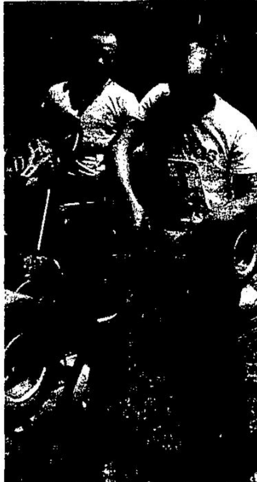
Everything has to be in perfect condition for the pre-race inspection. Skyrocketing prices make maintenance an important part of Go-Karting.