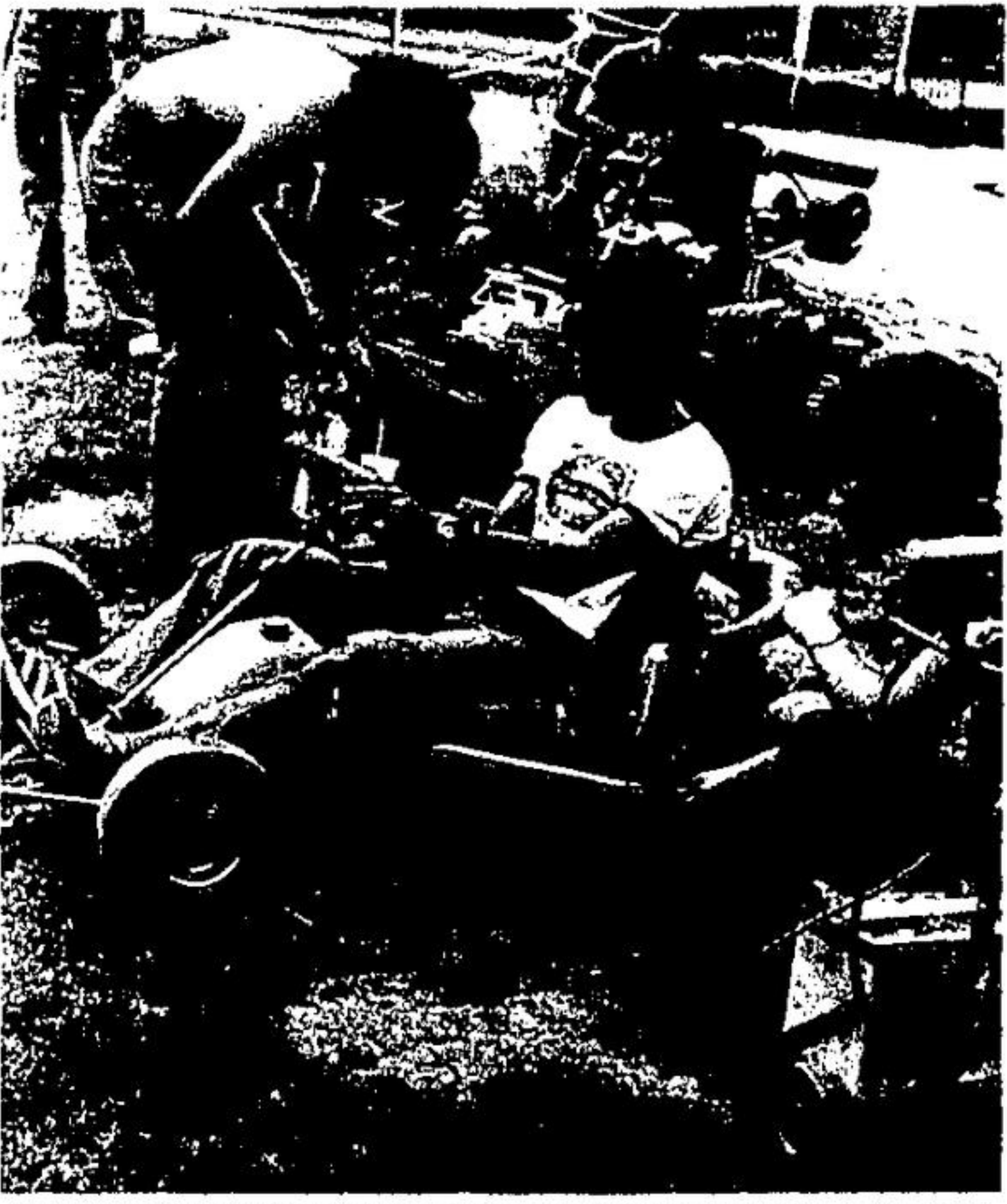
Revving up the engine for the big race. Driver and pit crew do a last minute check.