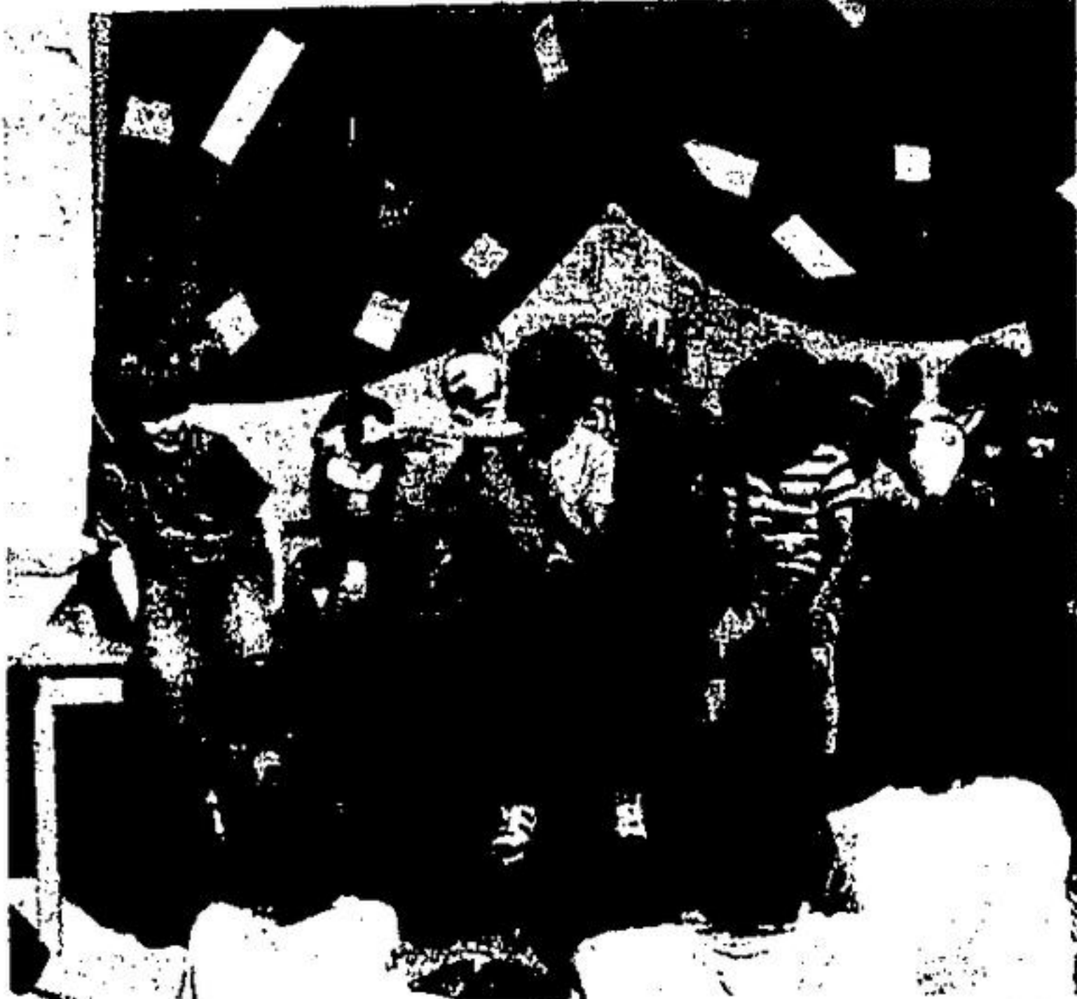
Creative summer fun at Rockwood Sports-Crafts Summer School. Here, children display their ind. Ideally designed props to be featured in an upcoming puppet play production.

Ladies continue to gather for fun games Monday, Wednesday and Friday mornings starting about 9 a.m.