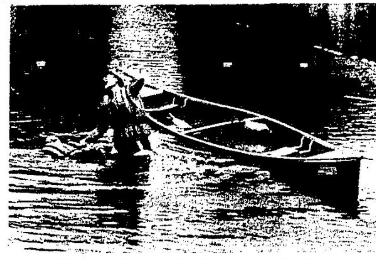
accident. After the safety demonstration the troupe took willing learners to the waters to learn different canoeing strokes.