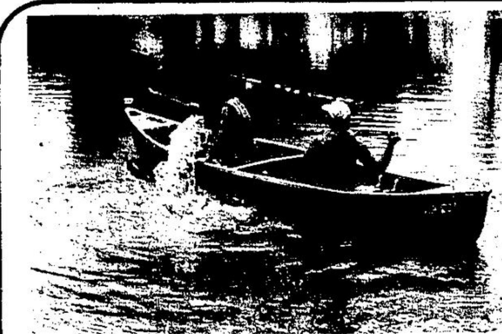
Three young ladies from 'Paddlecade Ontario' brought their canoes and accessories to Fairy Lake Wednesday to demonstrate the do's and don'ts of canoeing safety. In the picture on the left the two instructors demonstrate a little horseplay.

"It will be a nice souvenir to bring home," said his mother in a telephone interview Tuesday.