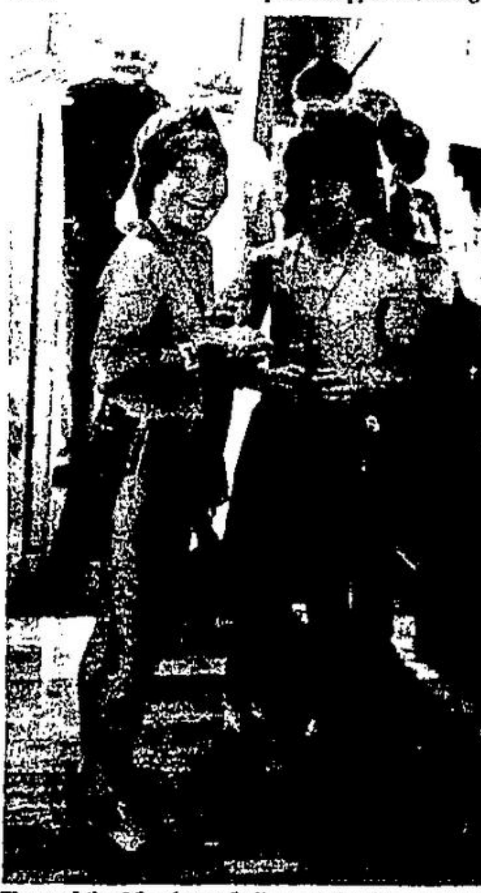
Three of the Limehouse Indians at the Canada Day ceremonies. The boys are members of the local Cub group. Rain forced the annual picnic inside.