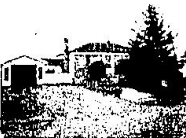
GORGEOUS COUNTRY HOME ON EDGE OF TOWN

Super clean, well decorated 2 storey home on large lot & quiet street close to schools. Gleaming oak floors throughout, cozy fireplace, formal dining room, large front verandah & much more.