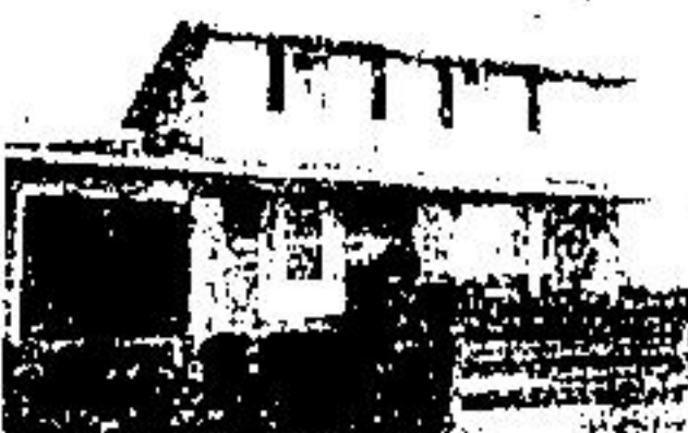
2 STOREY ELEGANCE!! ONLY $68,900

Truly immaculate 4 bedroom home close to all amenities. Many enhancements such as 4 appliances, 2 baths, tasteful decor throughout, rec room, formal dining room, fenced lot & more. Don't delay, call today!!