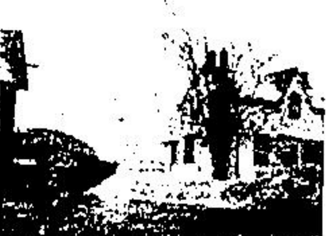
HAVE YOU ALWAYS WANTED TO HAVE YOUR OWN BUSINESS

Lovely stone & brick 4 bedroom home on well landscaped lot, 2 baths, brick fireplace in family room, large eat-in kitchen, dining room with walkout, 4 appliances. Vendor very anxious. Phone for an appointment for your personal inspection.