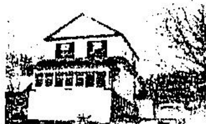
'GO' TRAIN SPECIAL! $4,000 DOWN!!!

$54,900. Super brick bungalow on large, well treed lot (130' deep) on extremely quiet street. Detached garage, fenced yard, extra bedroom or rec. room downstairs. Walk to 'GO' train.