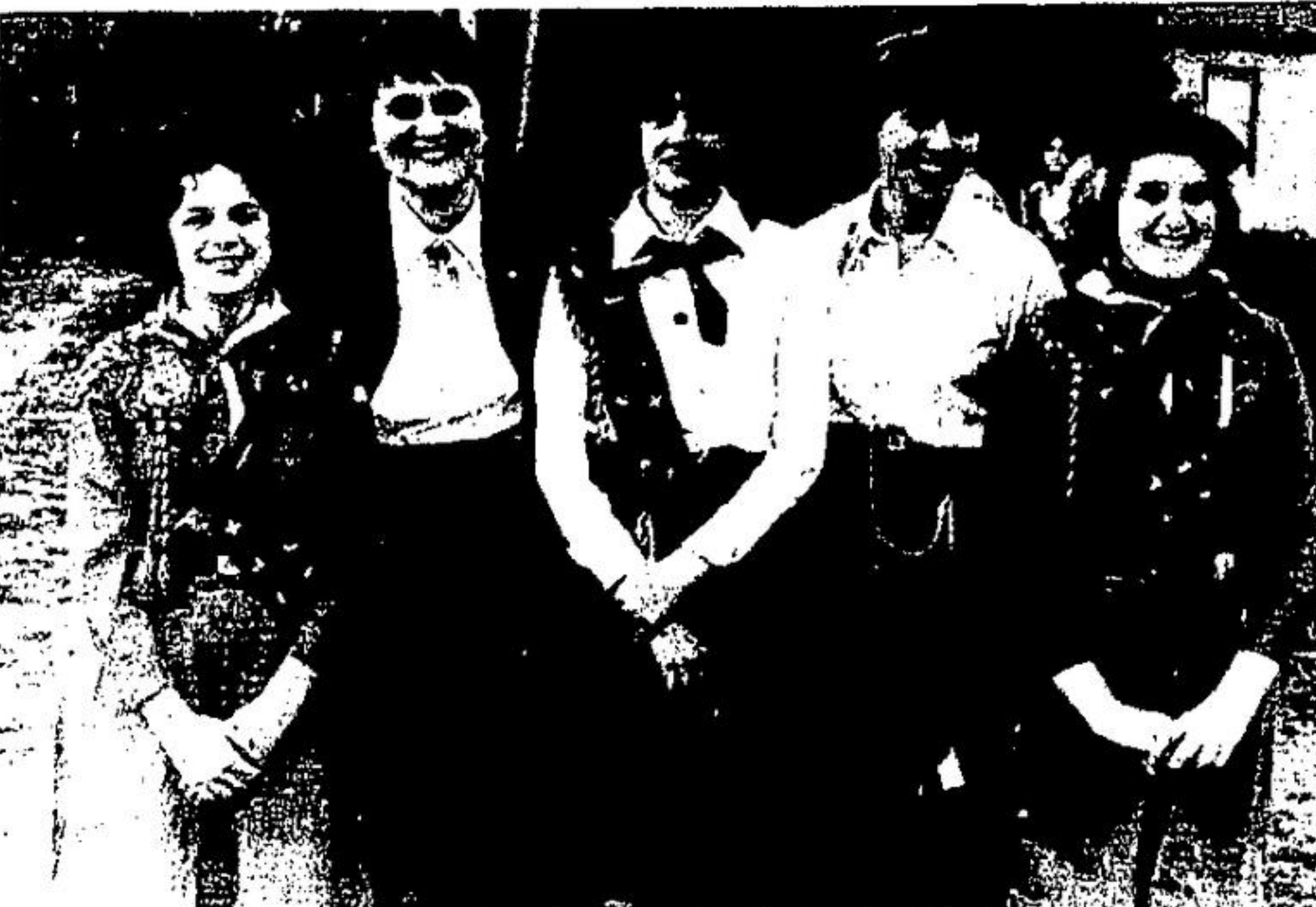
Three Eden Mills Co. Guides recently received the last Canada Cordis awarded in the local Girl Guide Movement. The Canada Cord is the highest achievement level under the present system. Come September the national organization's age groupings

Richress Ltd.'s Rockwood subdivision proposal is premature, according to Eramosa Planning Board and council supported their opinion, returning the Ministry of Housing's questionnaire unanswered. The approximately 100 acre property parcel is located behind the Rockwood Academy in the village's extreme southwest corner. A proposed Frederick St. extension would provide the housing area access.