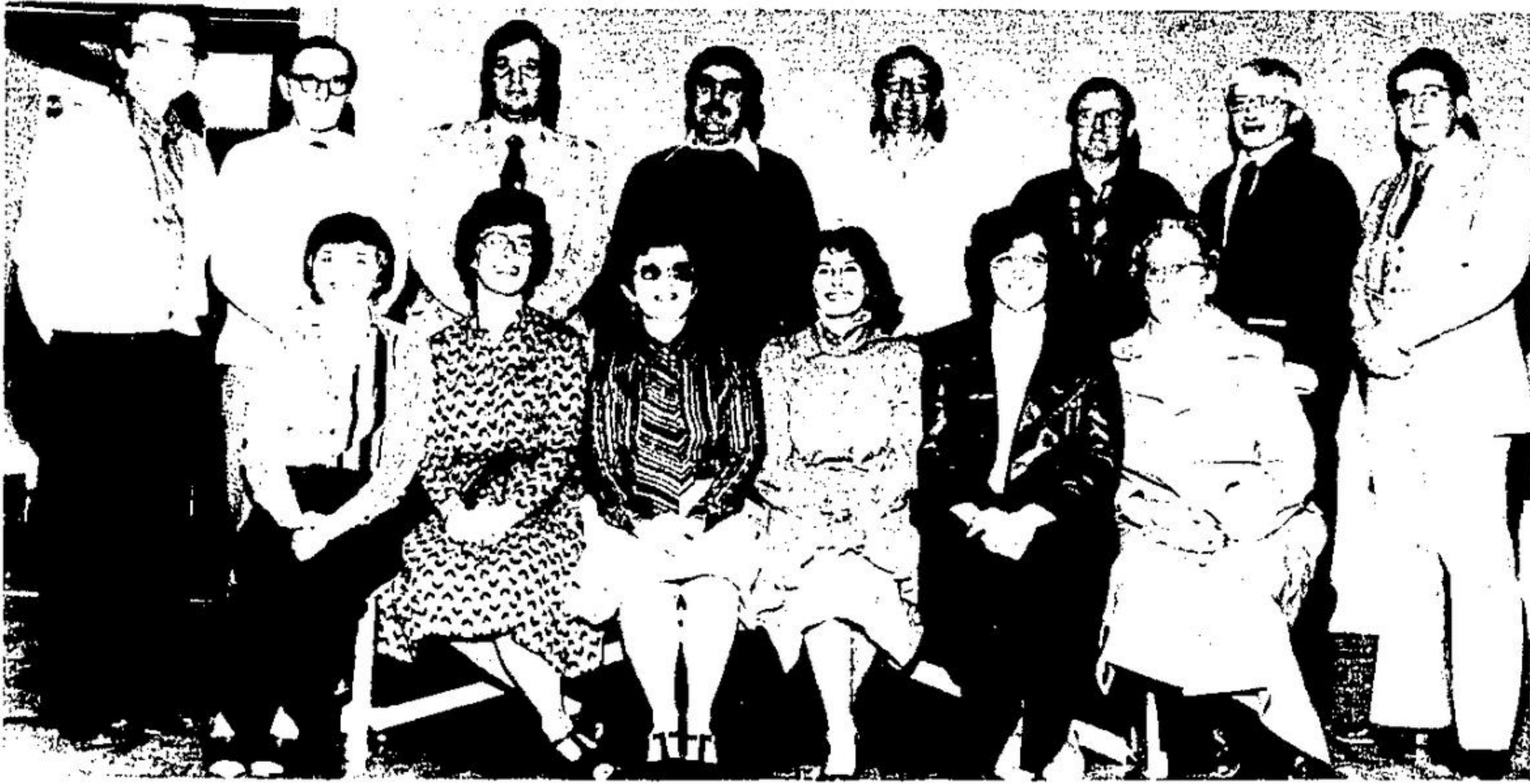
Murray Memorial YMCA executive got together for a photograph last week. Seated from left to right are