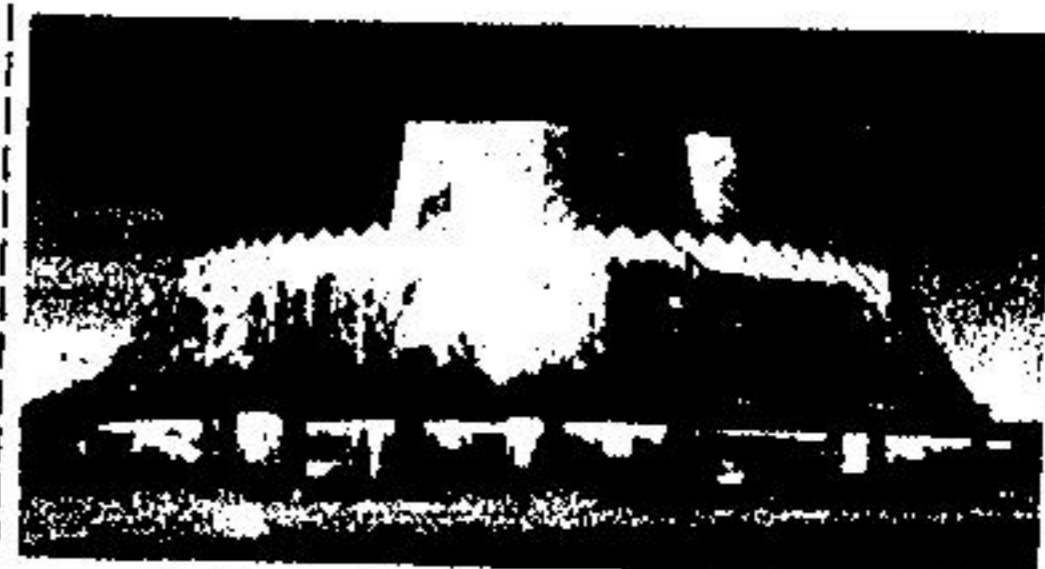
New Massey Hall