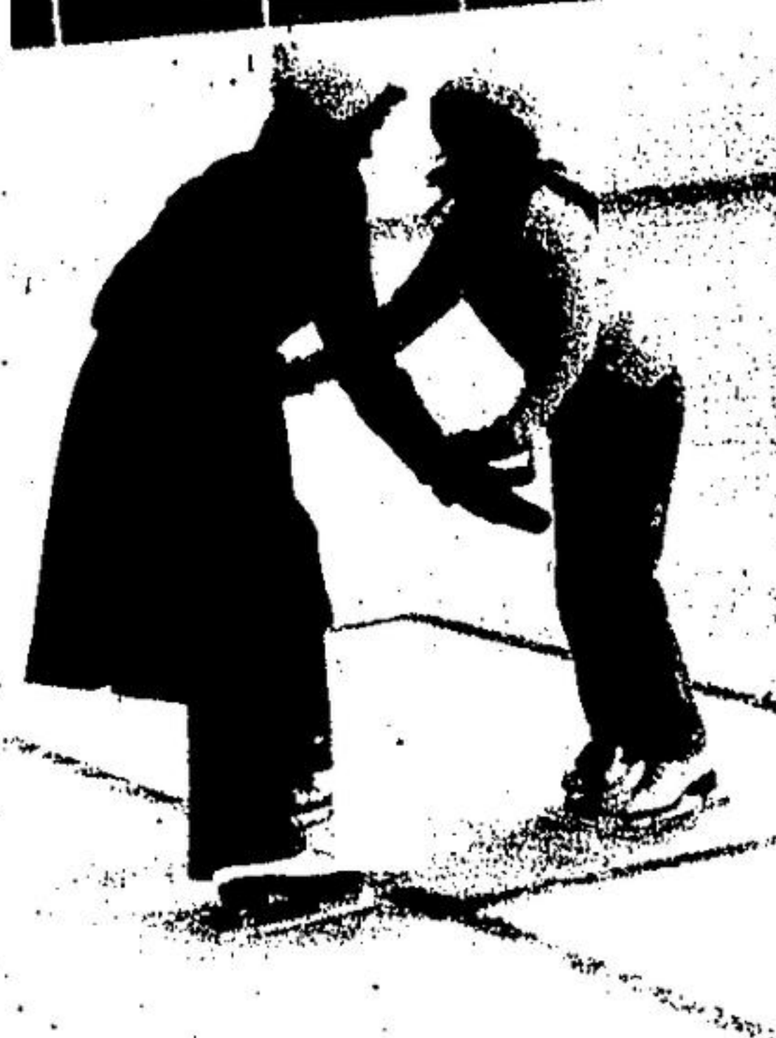
Colleen DeBruyn helps out one of the younger pupils of the Acton Figure Skating Club.