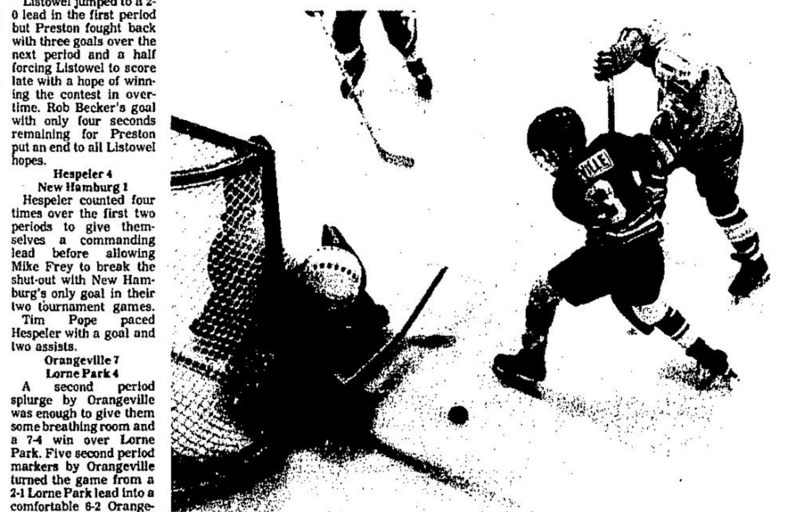
In four years, defeating Orangeville 7-0, Jordan walked off with the consolation crown with a 9-0 win over Hespeler.