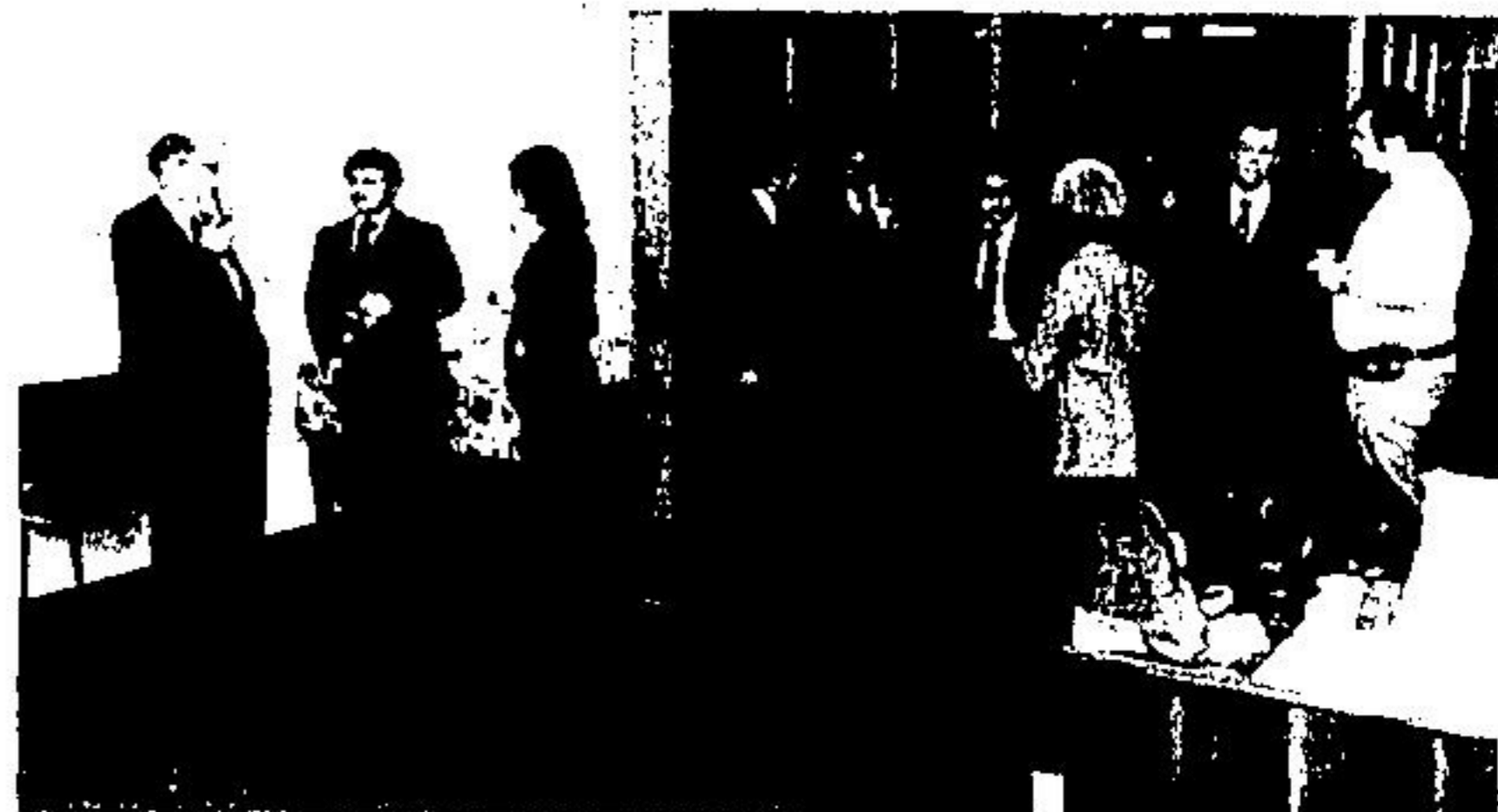
Many visitors dropped in for refreshments during the open house of The Permanent Friday.