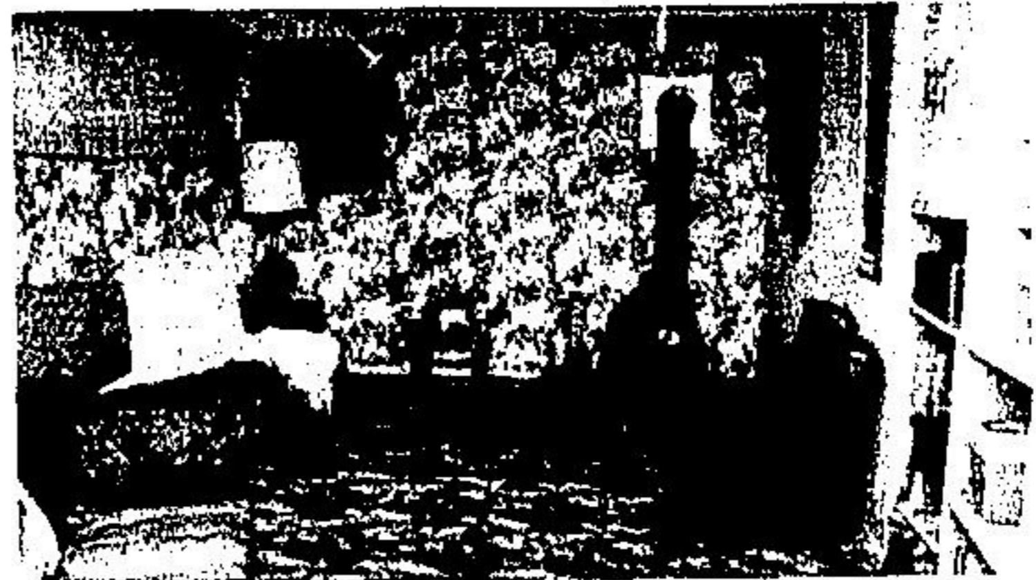
GRAND ENTRANCE $71,900.

The feature of this fine home is the large entrance foyer leading to livingroom/diningroom area plus efficient kitchen nook eating area. Three good size bedrooms plus finished recreation room with Franklin fireplace. The future den or office off the back door is an extra bonus plus an Inground pool installed in the summer of 1978. For a personal service and viewing of this property call Eleanor Langdon.