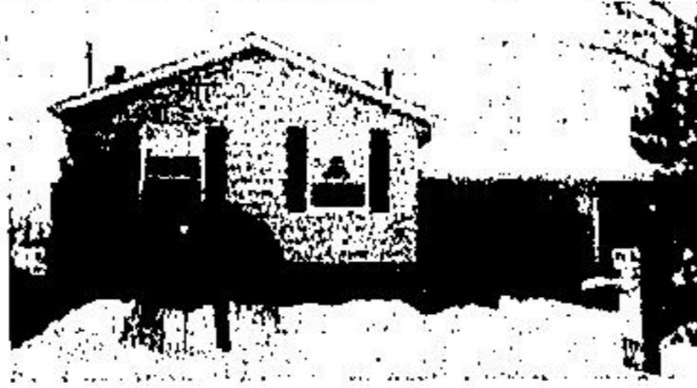
START OUT WITH EXECUTIVE EXTRAS

• Cedar deck front and back • Basement walkout • Holiday kitchen cupboards • Broadloom • American Standard Fixtures, 2 4-pc., 1 2-pc. • Twin-Windows • Redwood garage door • Concrete driveway • Family room fireplace • Pie shaped lot. Call Eleanor Langdon.