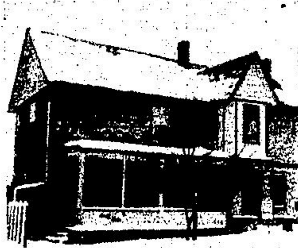
DOWNTOWN DEVELOPMENT POTENTIAL

Do you have country living in mind? The location gives you easy commuting time to Acton or Georgetown in less than 10 minutes. The home offers three bedrooms, living room, dining room, and you will love the finished recreation room with log burning fireplace to help with the heating bills. The yard overlooks a 1 acre trout pond adjacent to the property. (Call John Caton for detailed directions).