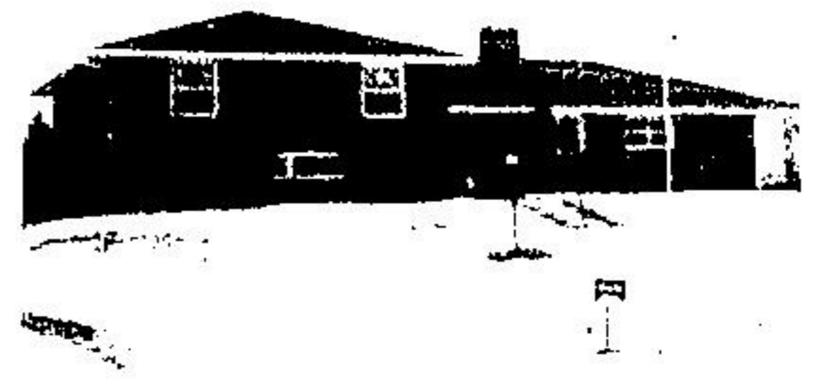
EXECUTIVE RETREAT $129,900.

Superbly landscaped! 16x32' Inground heated pool, central air conditioner, electronic air cleaner, floor to ceiling brick circular fireplace, dark strip hardwood flooring, broadloom in main traffic areas. All this plus a lovely home with 3 bedrooms, 2 baths, and family room for $69,900. Contact John Caton. DON'T WAIT.