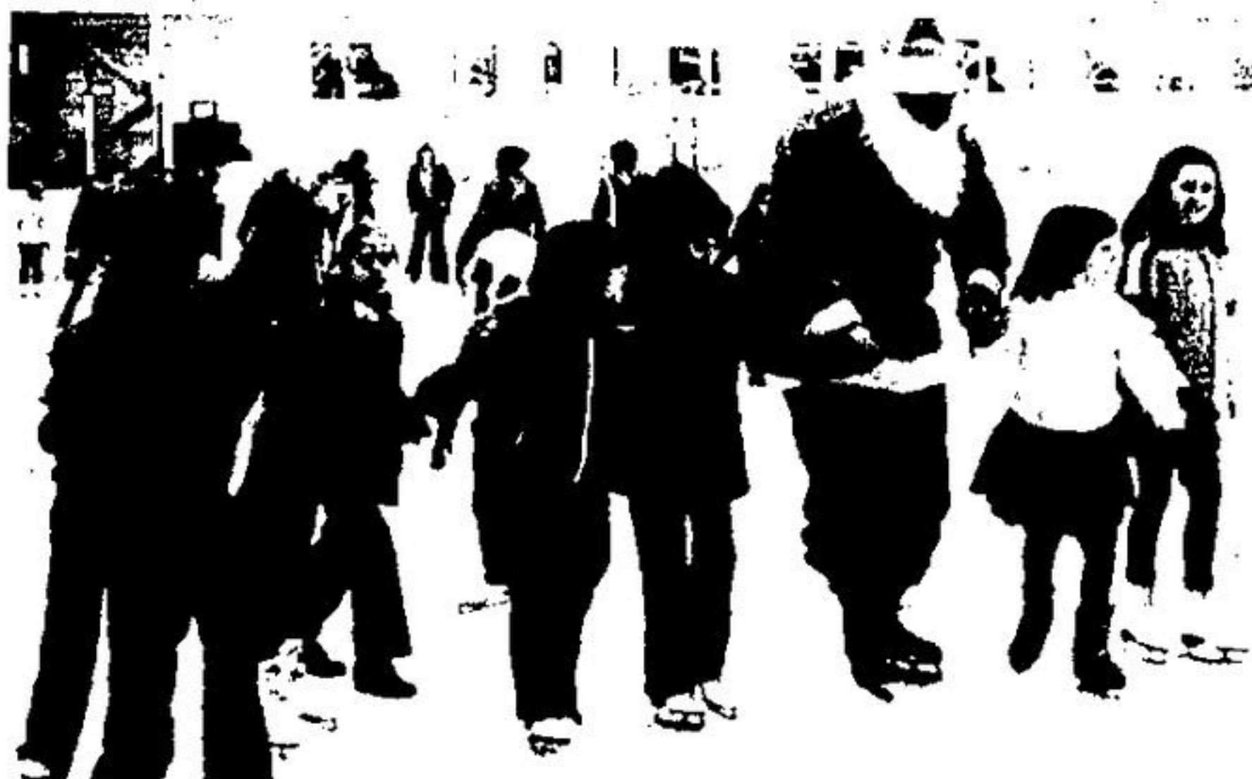
After the junior figure skating competition at the community centre last Thursday Santa Claus took some time to skate with the children.