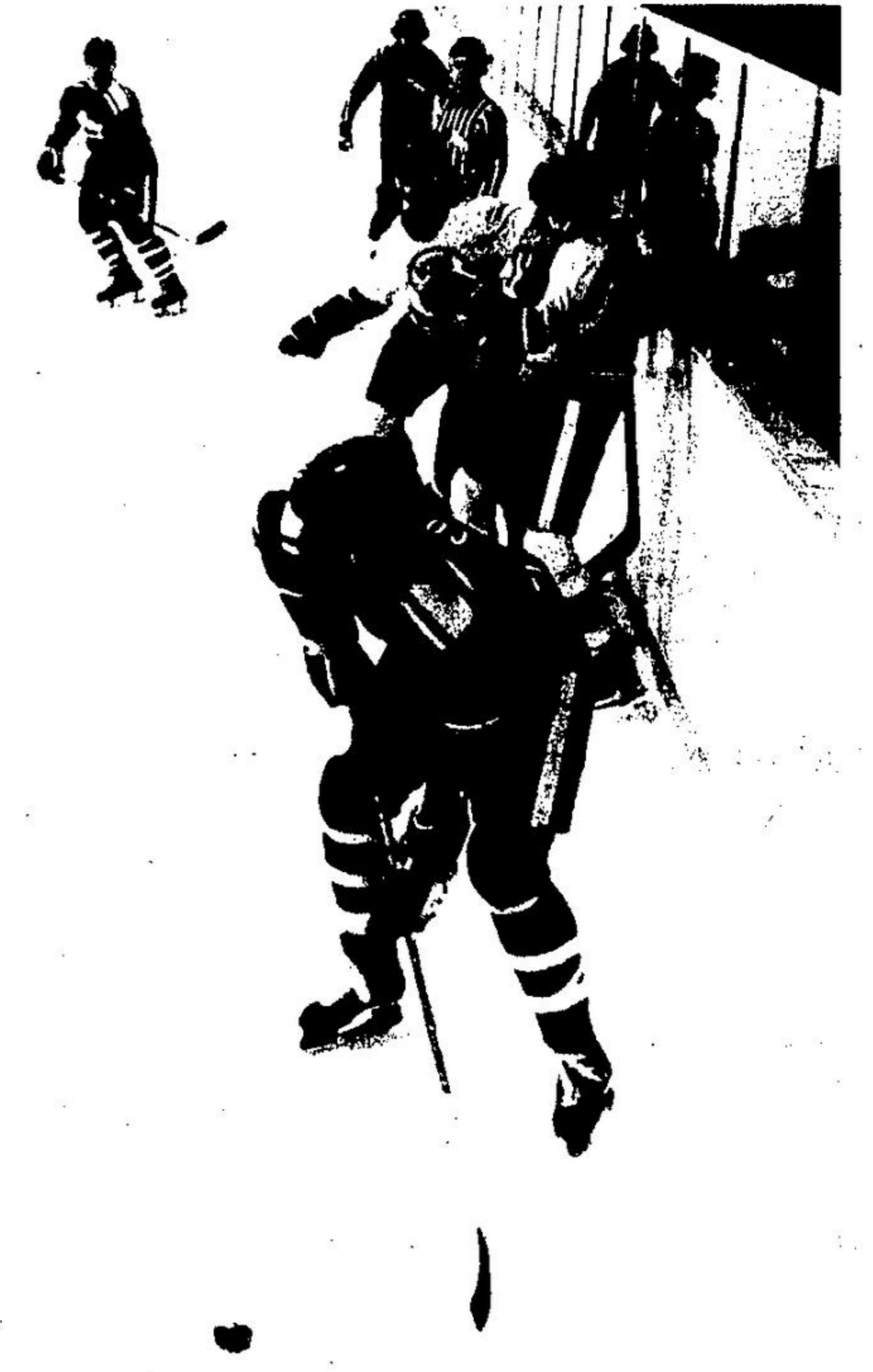
One Oakville Blade took two Sabres out of the play here to give the Blades time to set up a play in their offensive zone. The teams scored four goals each in the first period and then settled down. Unfortunately for Acton the Blades settled down in time to score an 8-4 win. It was the Sabres' ninth loss in succession.