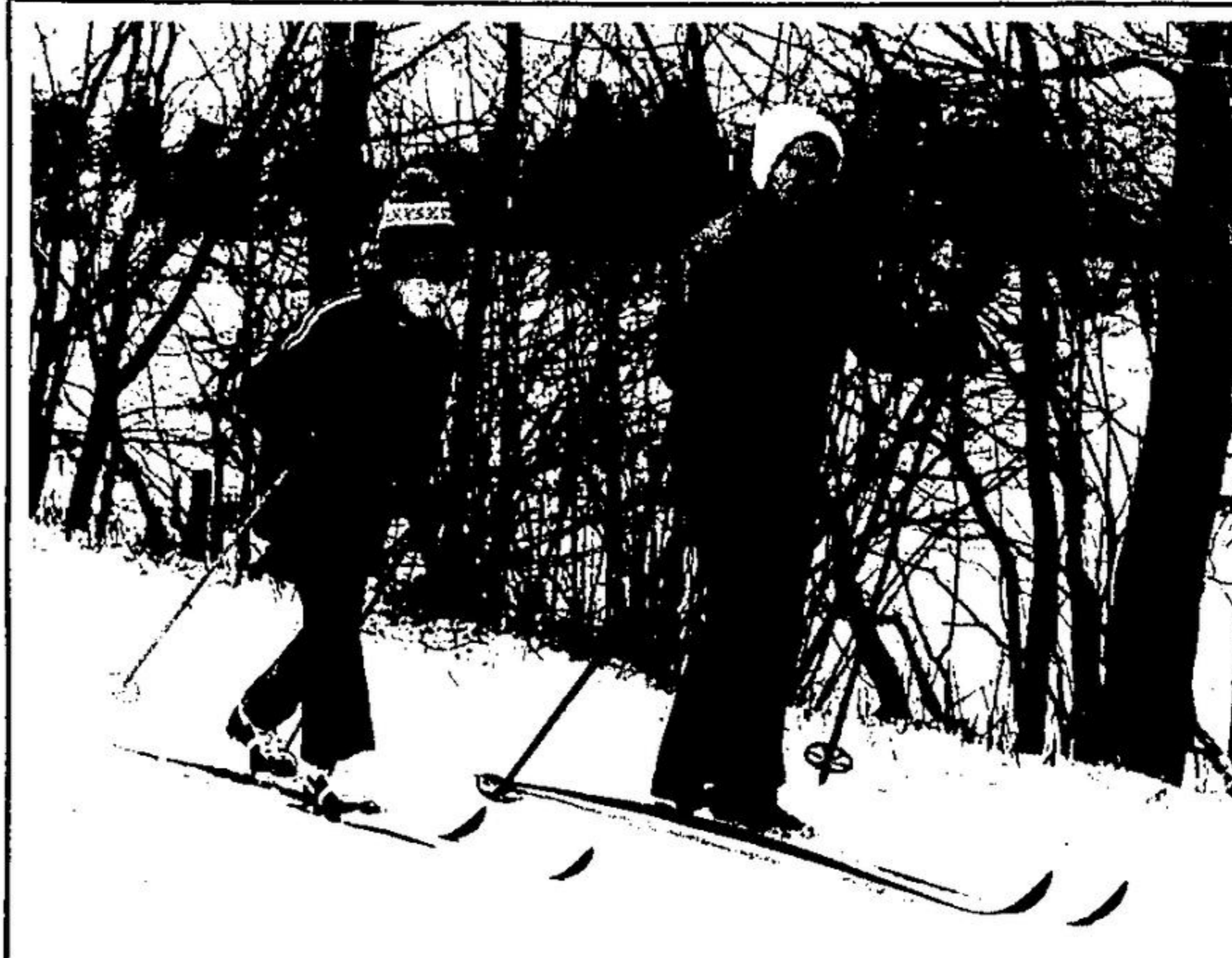
Cross Country Skiing is fast becoming one of Canada's most popular winter sports. The Canadian Association of Nordic Cross Country Ski Instructors have distributed a series of