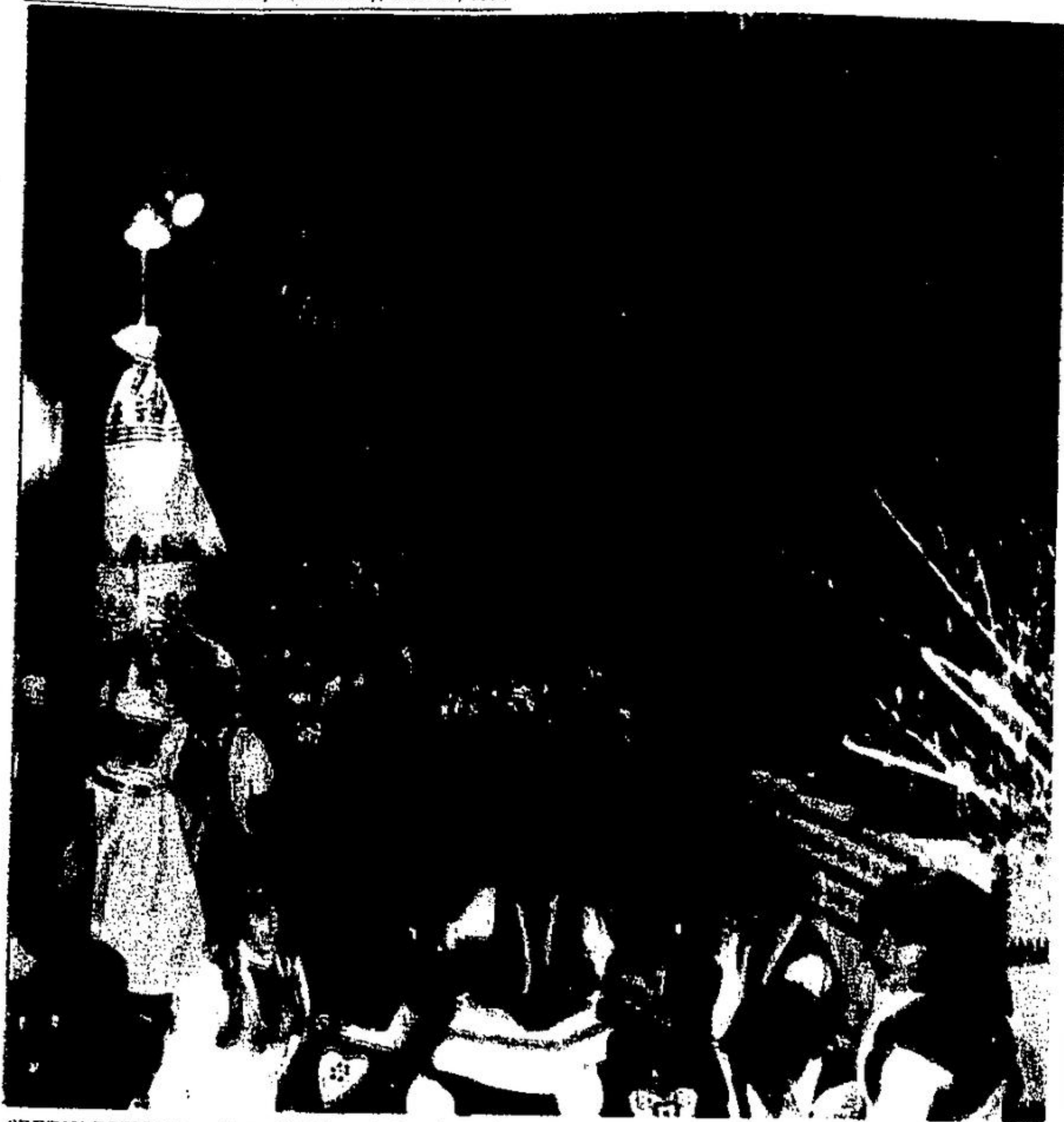
SRETAN BOZIC means Merry Christmas in Croatian and these children, members of the Croatian folklore group "Zrinski and Frankopan" perform in an annual show, "Christmas Around the World." The group is proud of the national heritage so the Croatian colors—red, white and blue—appear on top of the Christmas tree while in the middle

is the scene from Bethlehem. This group has performed at many state occasions in Ottawa, in front of Her Majesty the Queen and at the White House in Washington. They are willing to appear locally at such events as fairs. Information can be obtained from the editor of the Croatian Voice, Acton.