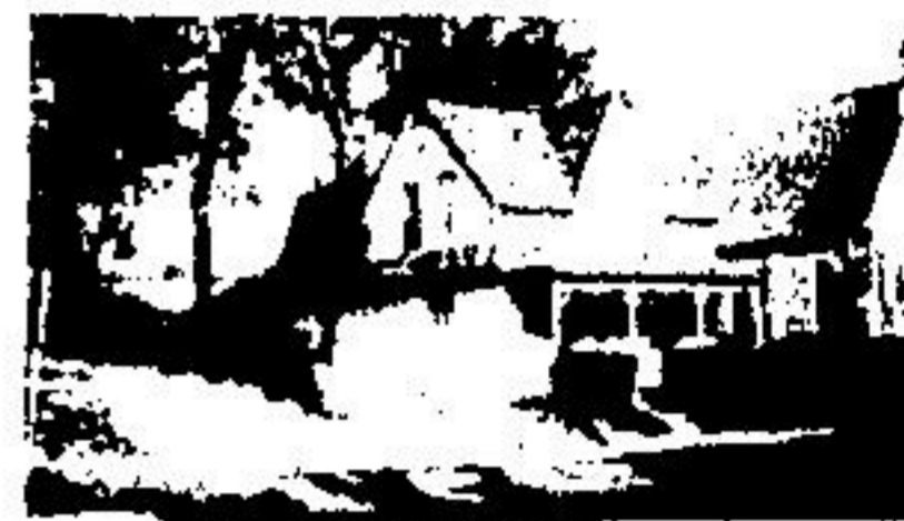
WHAT A LOT

3 bedroom brick bungalow close to stores and schools, finished rec room with wet bar, pool with equipment, only $58,900. Call Joan Thoms 877-5237 or res. 877-6342.