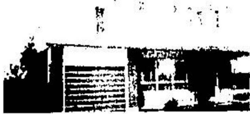
UNPARALLELED MASTERPIECE OF FLAWLESSNESS

The entire family will be delighted to move in to this solid brick century home, separate dining room, spacious modern kitchen, main floor laundry room, 3 bedrooms and lots of interesting nooks and crannies. Nothing to do but move in - it's impeccable! Call Sandra on this one today. Asking only $65,900.