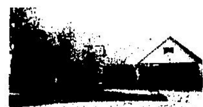
QUALITY AND DISTINCTION

Comfortable 3 bedroom sidesplit in exclusive area of homes, lovely family room, brick fireplace, extra den or 4th bedroom, 2 baths, 2 car garage. Let me give you a tour of this home. Call Ursula 877-5237 or 877-8368.