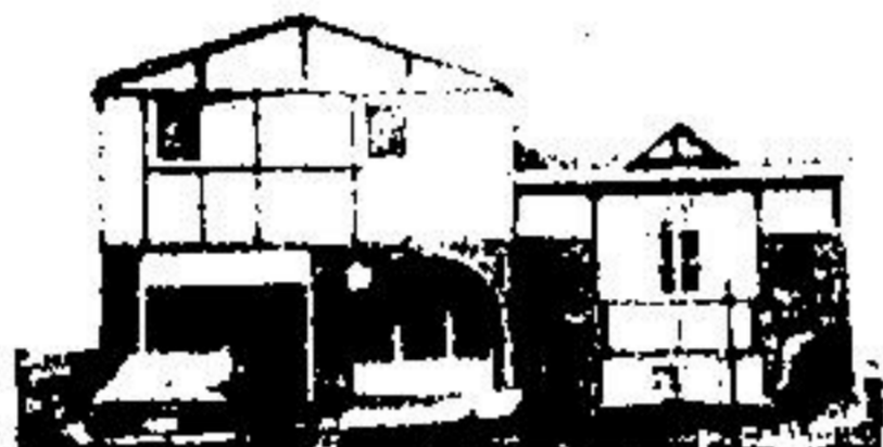
ACTON BEAUTY! $69,900.

Is just one feature of this 3 bedroom home that could be yours for Christmas! 3 baths, large kitchen, double insulation, 2-level basement are just some more! Why wait? Call Now - Shirley Yeo 877-5237 or res. 877-0366 to view.