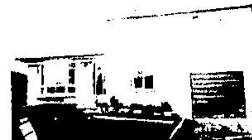
EVERYTHING YOU WANT

On this 3 bedroom bungalow with separate dining room, full basement, carport, located on a quiet Crescent and priced to sell now. Call Margo Clarke 877-5237 or res. 877-4637 to view.