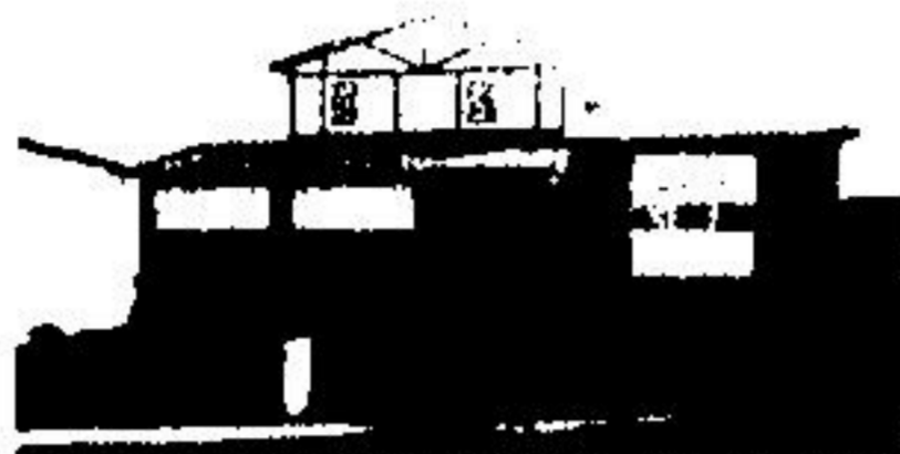
A FIREPLACE TO HANG THE STOCKING ON!