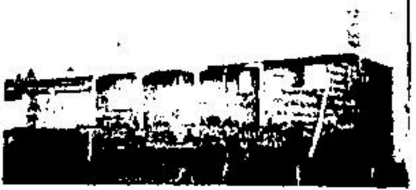
A TRIP TO FLORIDA FOR TWO

Can be yours in this gorgeous 3 bedroom bungalow convenient to schools and shopping, spacious living and dining rooms, super kitchen, huge rec room with fireplace plus a study and bar room. Best of all there is an excellent 10 per cent mortgage. You'll love it. Call Sandra 877-5237. Asking $68,500.