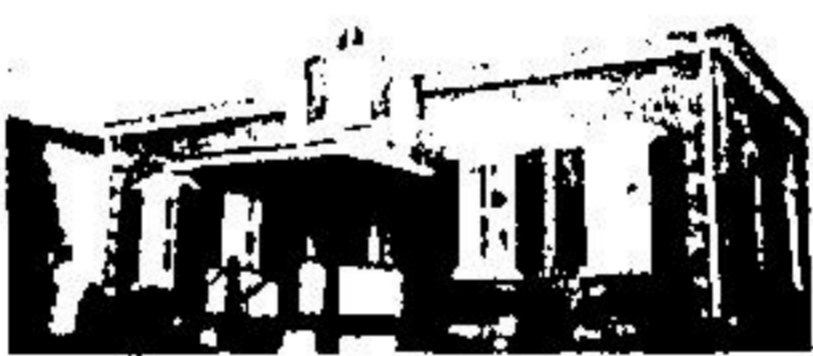
A PERFECT CHRISTMAS GIFT

Super bungalow with 3 bedrooms, walkout from dining room to deck. Beautiful brick fireplace in the rec room and much more. Call Sandra 877-5237. Asking $65,900.