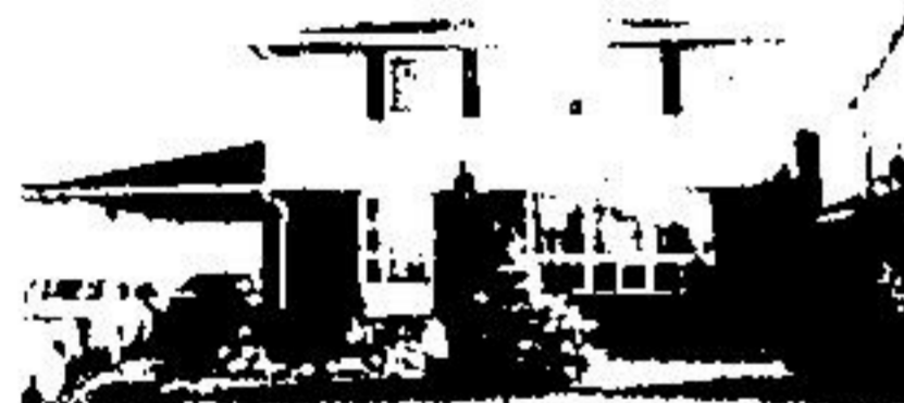
FOUR BEDROOM 2-STOREY HOME

This 3 bedroom country home is located east of Georgetown and just 1 mile north of No. 7 Highway. Owner transferred. Call Del for full particulars 877-5237 or res. 877-6189. Listed at $89,500.