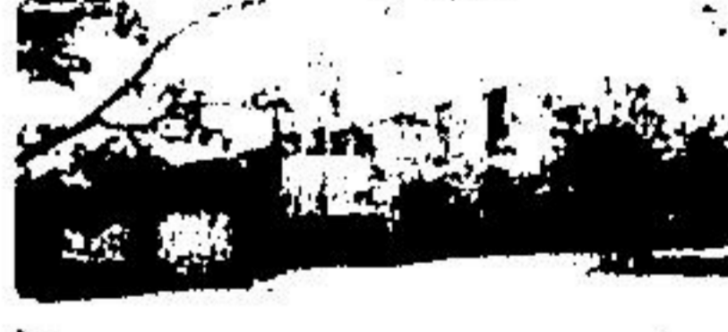
CONTEMPORARY ELEGANCE INGROUND HEATED POOL

Is in this immaculate Skopit home! 4 large bedrooms, main floor den, 2 washrooms, dining room, large eat in kitchen, fresh broadloom, big fenced lot with inground heated pool. Finished rec room, landscaped lot. $76,900. Call Bonnie Noguchi 877-5237.