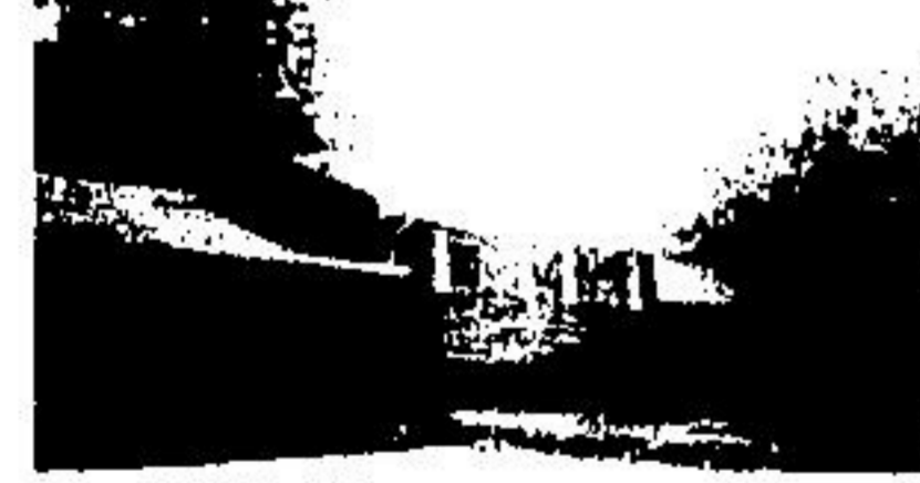
SPEND CHRISTMAS IN YOUR OWN NEW COUNTRY HOME - 1 ACRE OF TREES

With large eat-in kitchen plus formal dining room finished rec room with bar, recently installed broadloom, all drapes included. All this on a 148 ft. deep ravine lot. Listed at $69,900. Call Del at 877-5237 or res. 877-6189 to view.