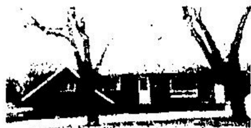
BIG COUNTRY LOT IN THE GLEN

Just $56,500 - Detached 4 bedroom, brick and aluminum bungalow, double paved drive and garage, 16 x 32 pool and all equipment. Finished rec room with wet bar. Hurry! Call Bob MacDonald 877-5237.