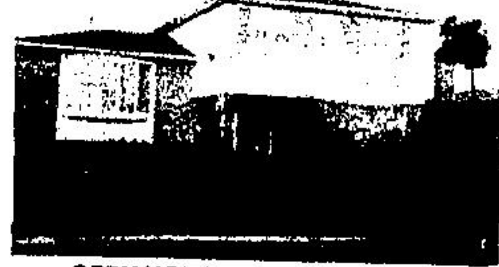
OPEN HOUSE, CROMBIE PLACE DEC. 2—24 p.m.

There is time left to pick colors and broadloom in this 4 bedroom side split in the prestigious park area. There is a main floor family room with a walkout basement, plus 2-4 piece and 1-2 piece washrooms. Give Sally Reed a call when you wish to see it. Asking Price $107,800.00.