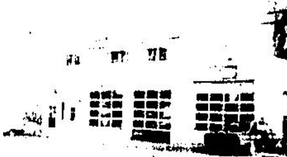
Buy Your Own Garage

This 2 storey brick home has 2 self-contained apartments and has recently been improved with a roof, wiring, aluminum soffits, fascia and eaves. Centrally located to schools, shopping and all amenities. For your exclusive viewing call John Caton.