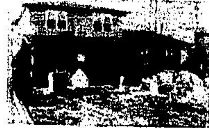
Open House—Harold St. Dec. 2—24 p.m.

There is a lot of living space in this three bedroom back split, all the features you need for a family house, eat-in kitchen, living room, dining room and large family room off the kitchen. Give Coring DePaoli a call at 877-2219 to view.