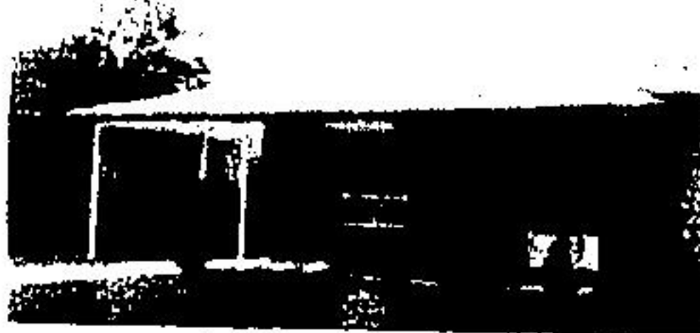
Custom Built Back Split Only 3 Years Old

New pool this year, finished recreation room with fireplace, built in cupboards and book shelves, broadloom, 3 bedrooms, entire home is very clean throughout, single car garage, paved drive. Call Eleanor Langdon.