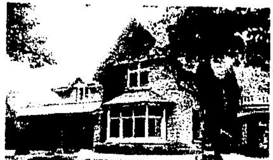
Christie Manor, Dundas, Ontario $289,000.00

73 Acres of land with bank barn, approximately 40 acres of good workable land, balance is mostly cedars with pond sites. An ideal location for your hobby farm just 20 minutes from Georgetown and close to paved road. Asking $87,500. Call Norm Sinclair.