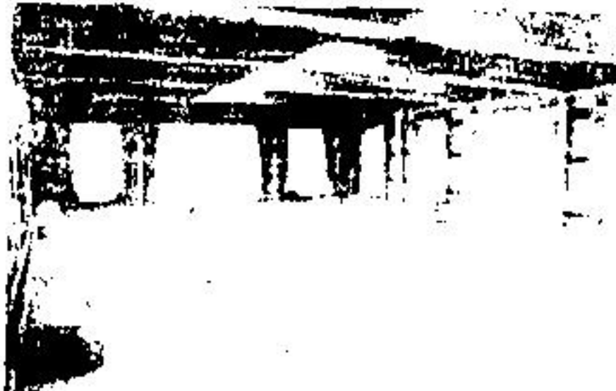
HIGH ON A HILL COUNTRY COMFORT

3 acres northwest of Georgetown with a 280 degree view of rolling pasture land. The house has everything to make it comfortable in winter, spring, summer or fall so all you have to do is call John Caton and I'll be there, to show you your future home. Price $168,000.