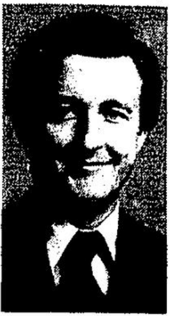
W. Galen Weston

Canadian Imperial Bank of Commerce announces the election of W. Galen Weston as a Director of the Bank. Mr. Weston is the Chairman of George Weston Limited, of Loblaw Companies Limited, and of other companies associated with the Weston Group in North America and Europe.