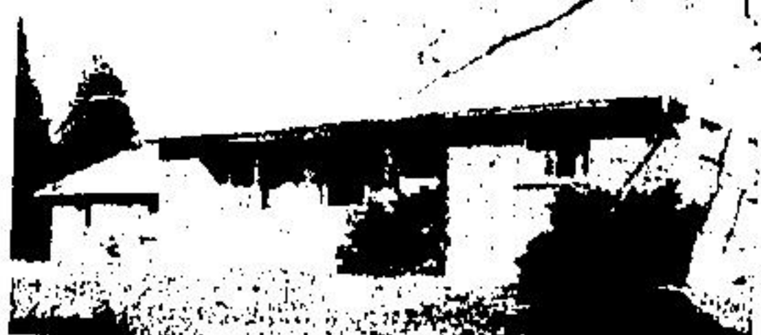
BUNGALOW PLUS 10 ACRES

2 storey four bedroom home. Private back yard. Beautifully decorated and broadloomed. Attached single garage and paved drive. Basement strapped and ready to panel. $58,900.00.