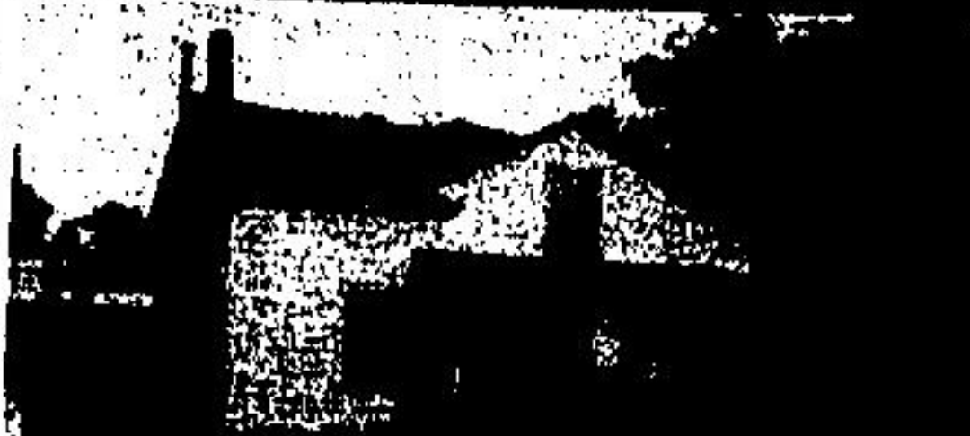
2 HOMES $62,900.00

25 MILL STREET EAST ACTON, ONTARIO L7J 1H1 (519) 853-3790