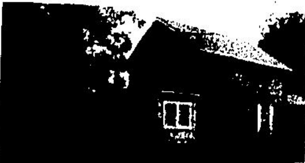
2 STOREY BRICK

Beautiful home in excellent condition, open foyer, 3 bedrooms, 2 washrooms, partially finished rec room with roughed in fireplace. Double car garage and many more extras, only $59,900.00.