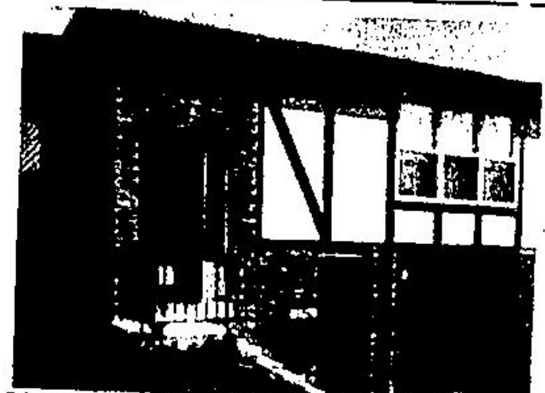
Brick and aluminum semi-backsplit, 3 bedrooms and family room, large open basement and attached garage, $49,900.00.

Nestled in a wooded lot, .82 acres of privacy. Long ranch bungalow, 4 large bedrooms, huge master bedroom, dressing room, 5 piece ensuite, sunken tub and walkout to 40' x 20' pool. A few of the extras are sauna, stone floor to ceiling fireplace, 4 walkouts, central air, vacuum and intercom, workshop, storage room, laundry area and double car garage. Please phone for more particular and private showing.