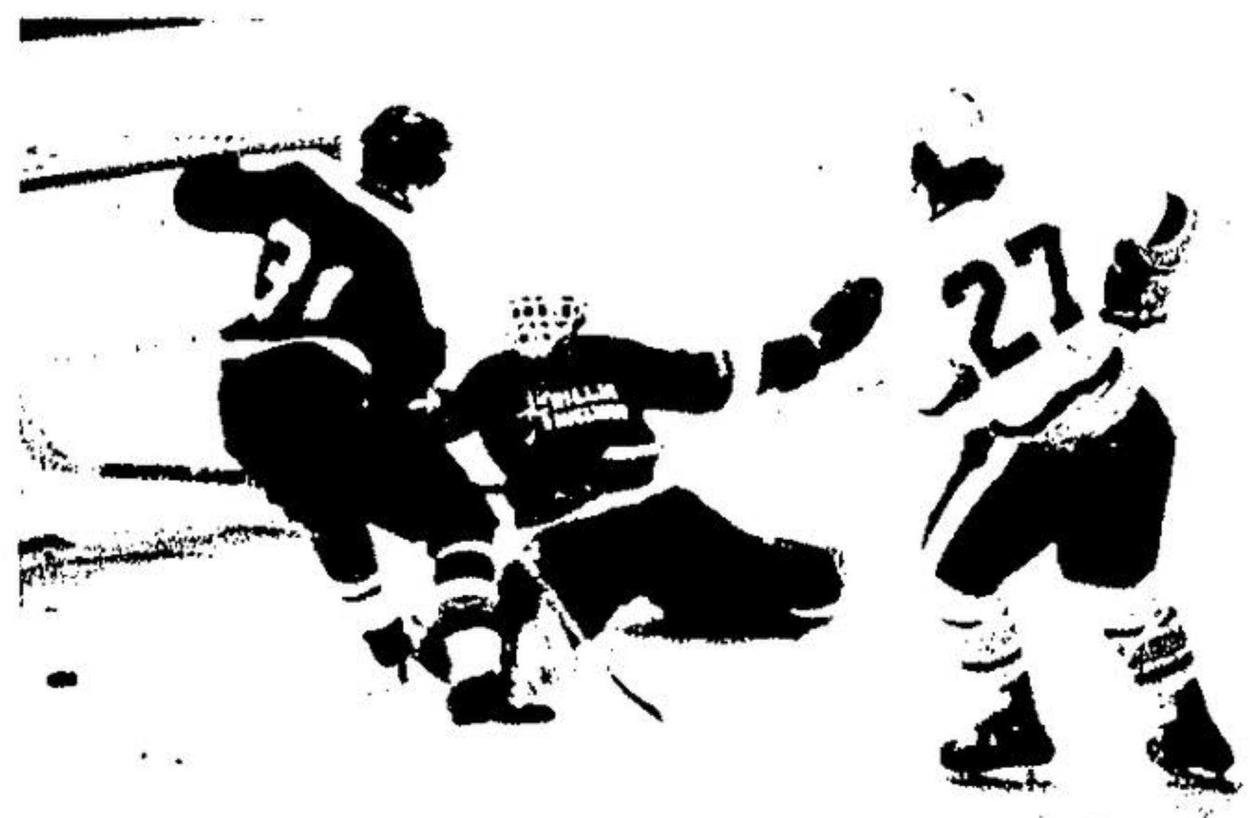
Off the post. . . .