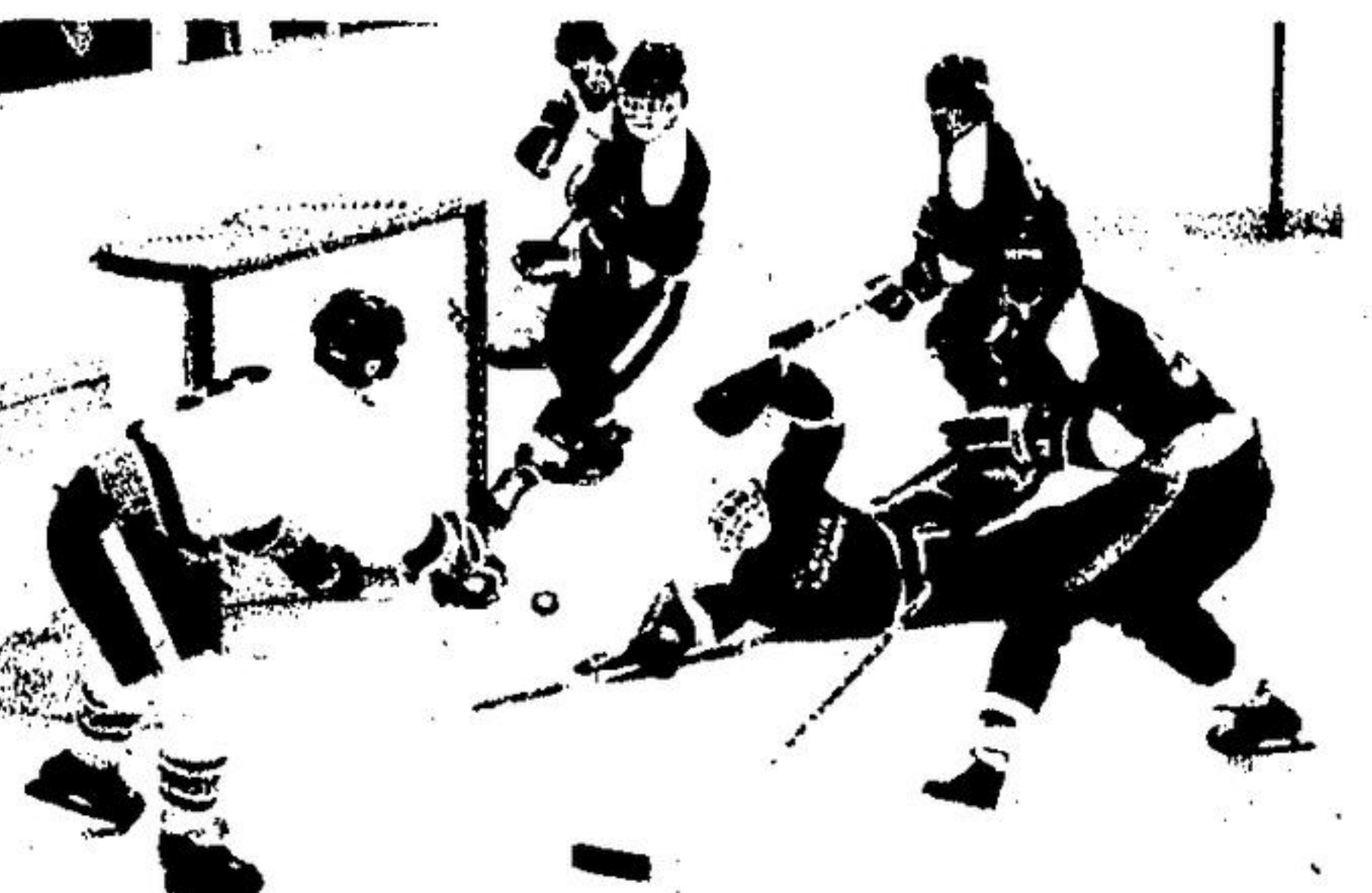
the wide open net . . . .