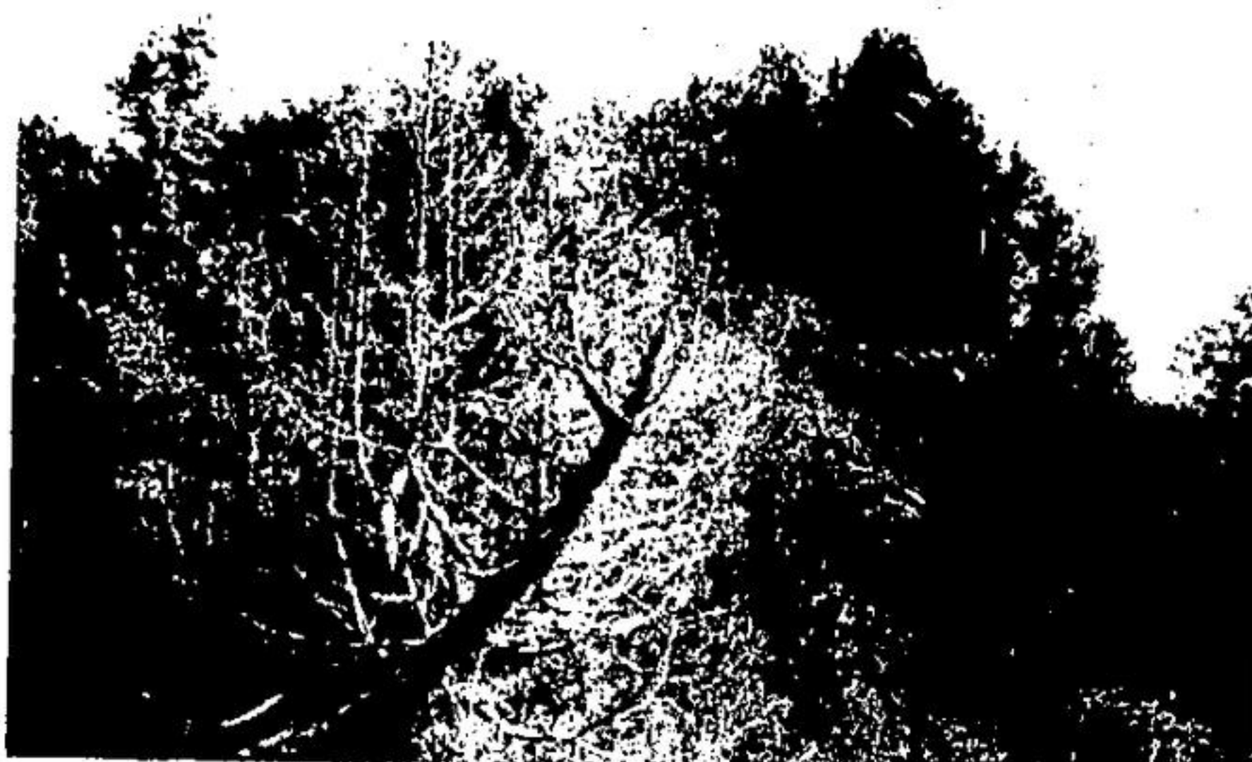
SNOW'S CREEK WOODS is an environmentally sensitive area stretching north of Highway 7 from Sixth Line to Eighth.

Third in a series of studies on environmentally sensitive areas in this district, based on a report from Halton Region.