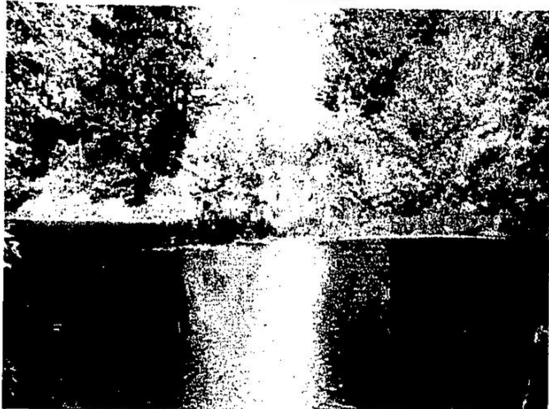
BALLINAFAD POND is part of a string of small ponds north of Highway 7 near Silvercreek.