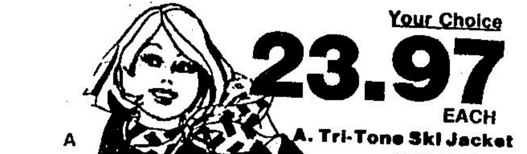
A. Tri-Tone Ski Jacket

Top fashion for juniors! Short-styled cire jacket with tri-tone detailing, hidden hood. Green, red or gold. Sizes 7-15.