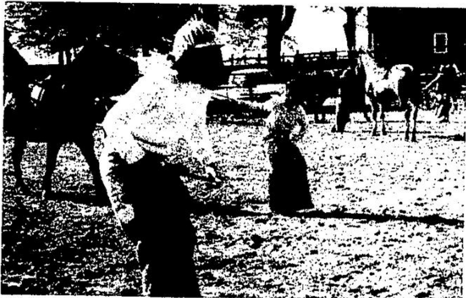
THE SACK RACE was one of the many exciting games entered by enthusiastic Rockwood Trail Rider Juniors at their Sunday Fun Day. Thirty young members brought their horses for games and refreshments to the Dales farm, Rockwood.

Parents had as much fun as their kids at the Rockwood Trail Riders Fun Day Sunday. This event, a casual show and games day for junior club members, is always good for a chuckle and this year's show had all the right ingredients.