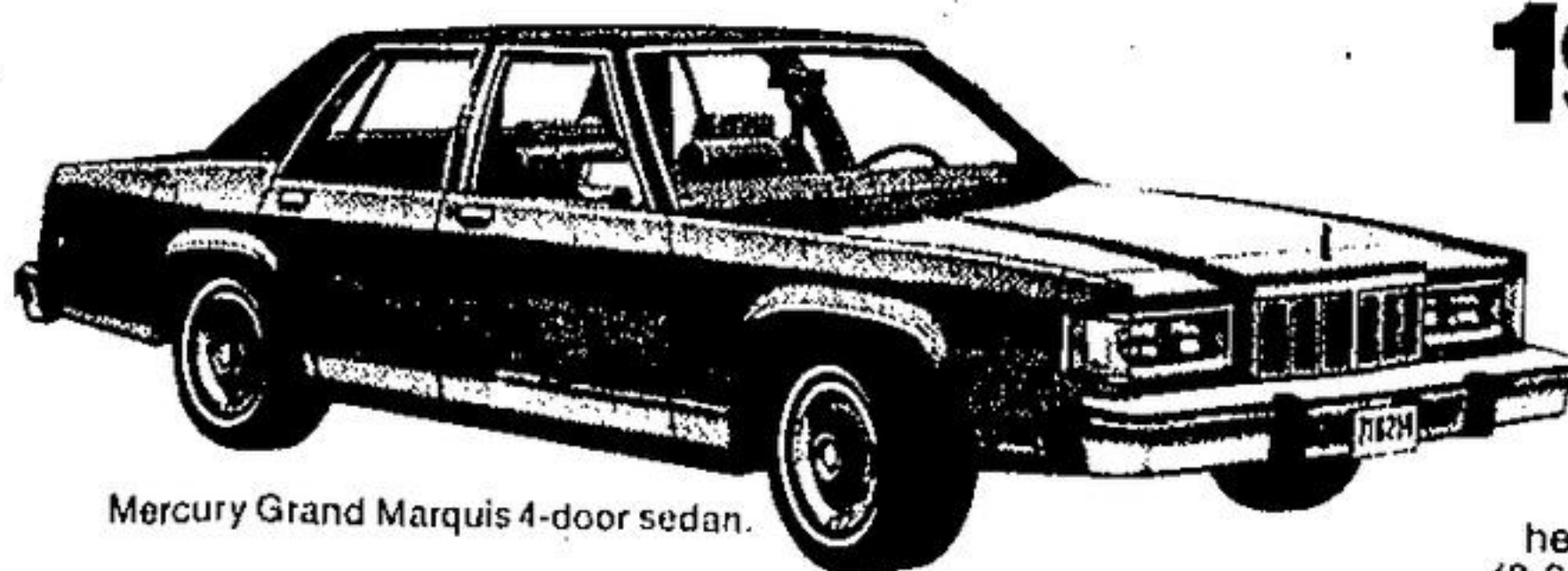
Mercury Grand Marquis 4-door sedan.