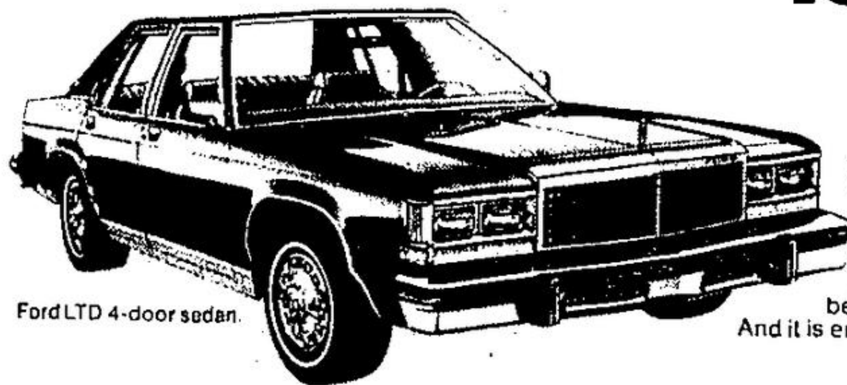
Ford LTD 4-door sedan.

Introducing an all-new car for the Canadian Road... '79 Ford LTD. More passenger room front and rear, more handling ease, more driver convenience and more window area than the 1978 LTD.