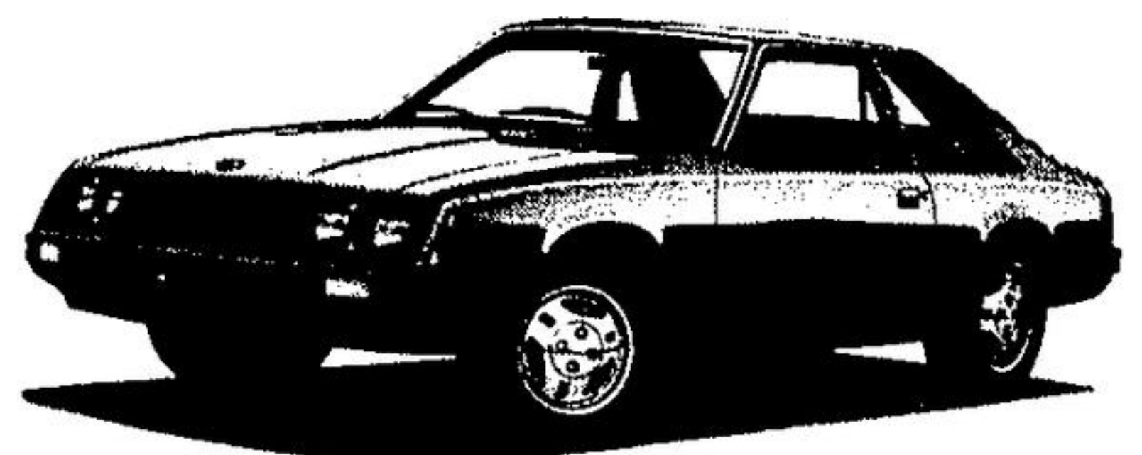
Ford Mustang 2-door sedan.

Dramatic sports car styling. The new Mustang has one of the most efficient aerodynamic designs of any car now built in North America, enhancing both road performance and fuel economy. Mustang '79 puts pure excitement back into driving, with precise handling from a new suspension that helps flatten corners. And Mustang offers a specially tuned suspension package for sports car-like response. Spirited performance. Mustang now has an optional turbocharged engine, as well as a standard 2.3 litre overhead cam, plus options of V-6 or V-8 power.