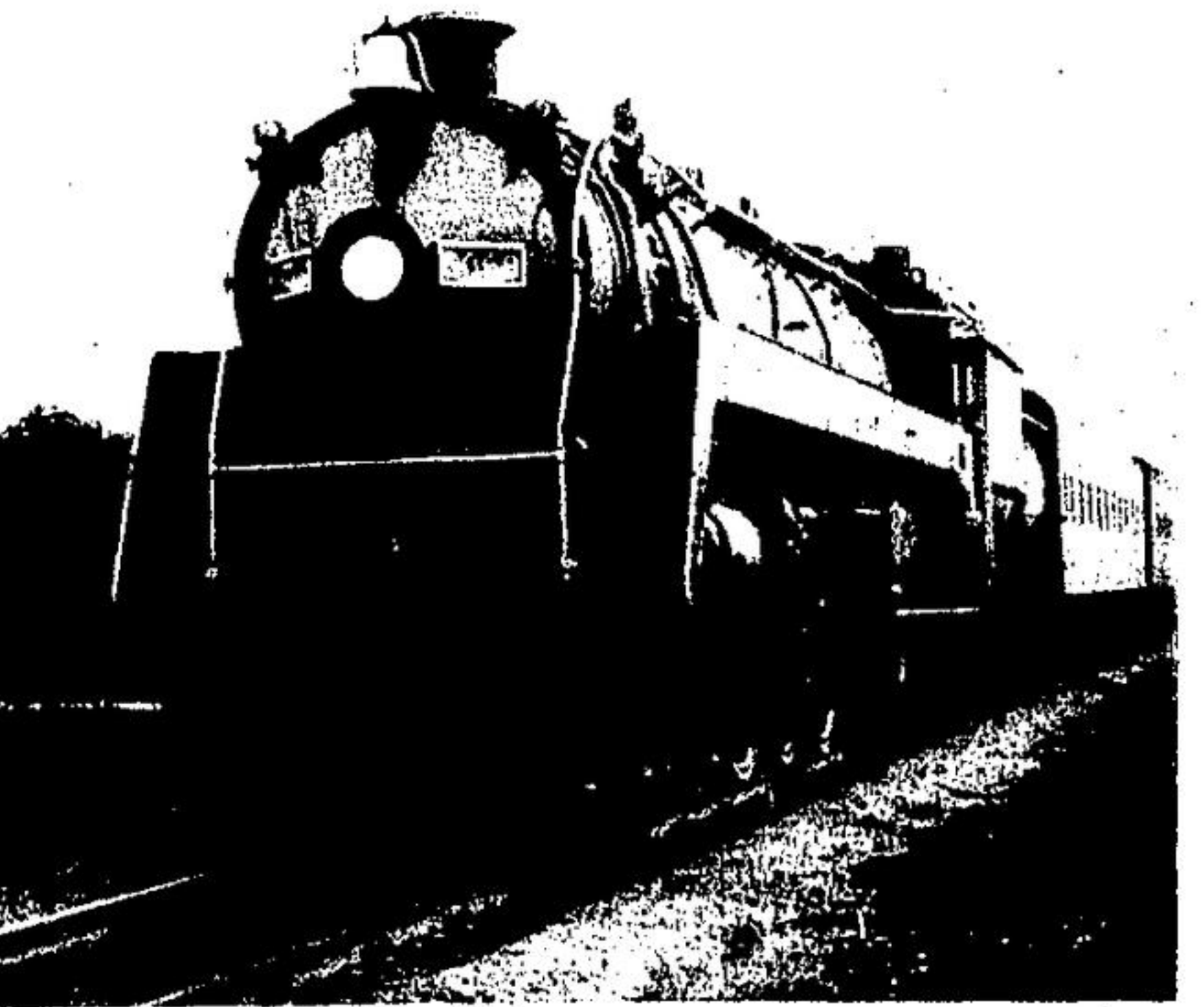
JUST LIKE the good old days! This steam engine, 6060, CN's survivor of the steam era, puffed through Rockwood yesterday with its whistle wailing.