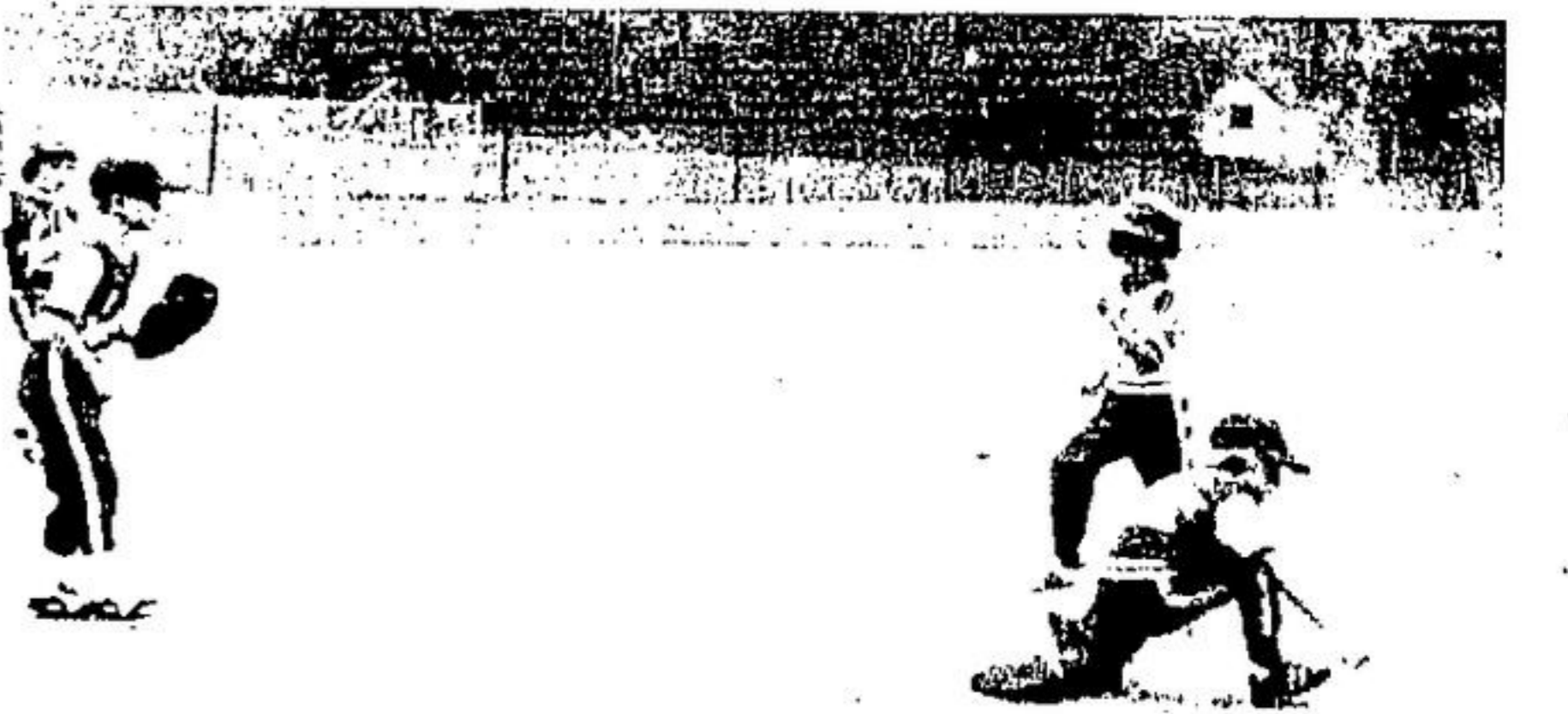
ACTON SQUIRT BOYS won the Halton Rural Championship and the Puslinch Minor Ball Tournament over the last week. Here, one of the Acton squirts tries to make it to third base as the Lowville player desperately makes an attempt to get the runner out. Acton went on to win the Halton Rural game 2-1.

Acton has also won tournaments in Acton, Lowville and Glen Williams this season.