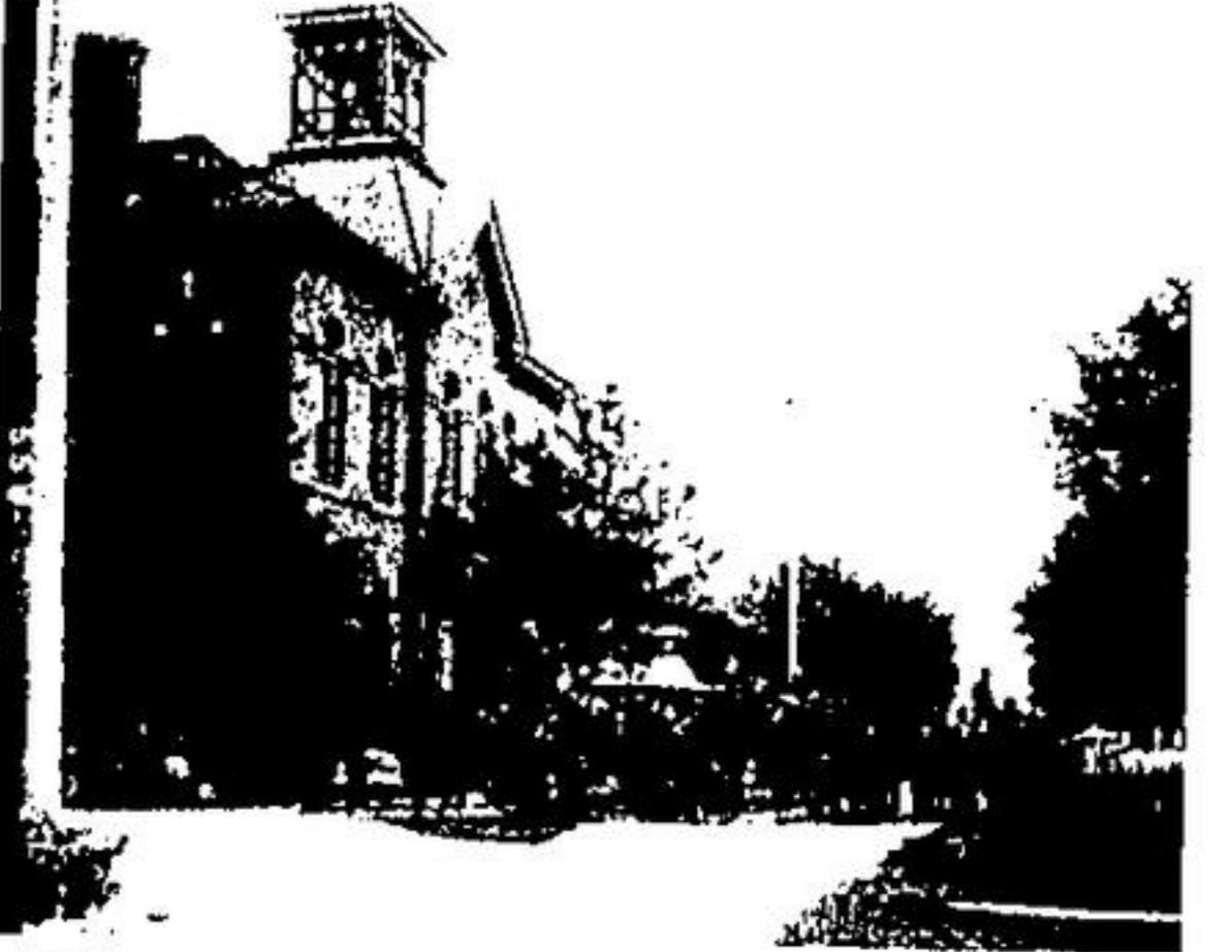
ACTON FIRE brigade poses in front of the town hall with their fire engine and reels on June 29, 1899.