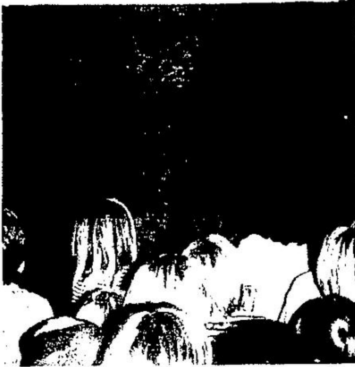
A PUPPET SHOW was one of the rainy day activities which kept children occupied at the town-wide recreation event last Wednesday. Children from Georgetown were bused to Acton for the fun water day at the park. Unexpected rain upset the leaders plans.