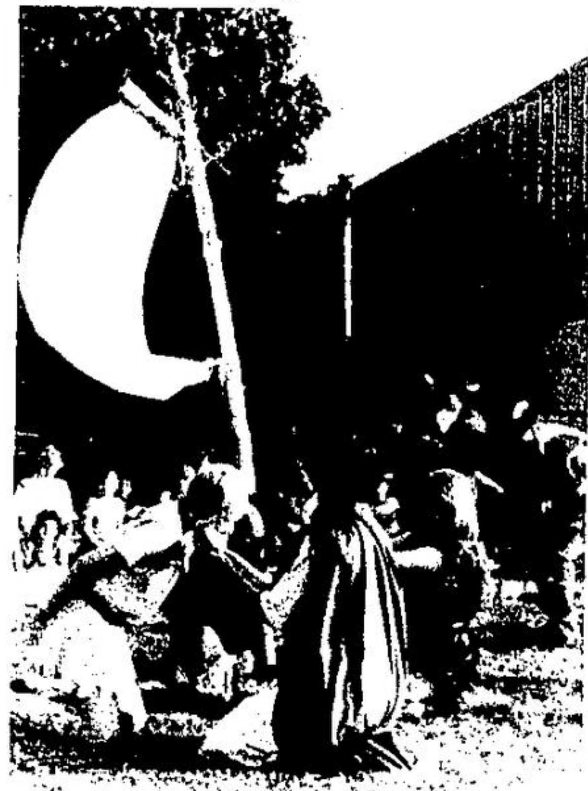
WATERMELON eating was one of the tasks skilfully performed at the day camp parents' night. The children combined the events into a Viking skit.

GEORGETOWN - 8 James St. ACTON - 12 Church St. PHONE 877-2207 PHONE 853-1660