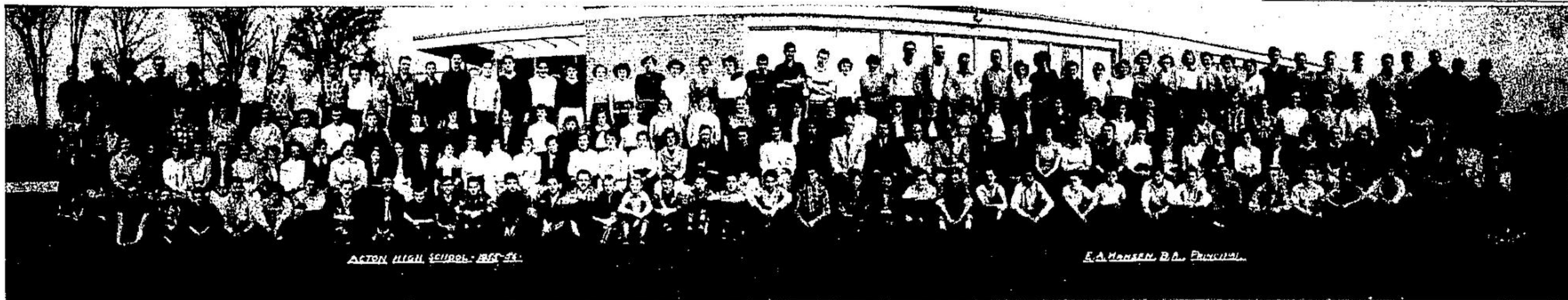
ACTON HIGH SCHOOL - 1955-56