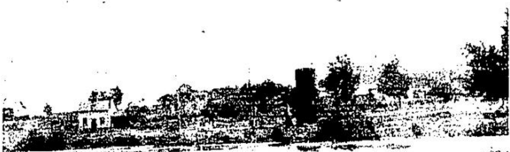
TORONTO SUBURBAN RAILWAY can be seen in this 62-year-old picture taken from Lake Avenue. Also seen in the photo are Fairy Lake and the water tank which supplied the steam railway.