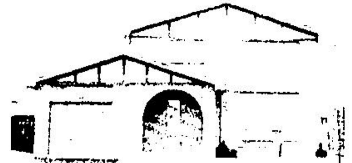
Large 4 bedroom 2 storey in Acton. Large kitchen, dining & living rooms, roughed in fireplace in family room. Owner transferred. Reduced to $59,500.

A. E. LEPAGE Real Estate Professionals Since 1913