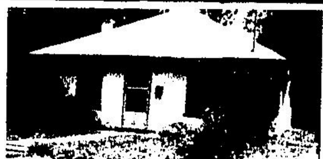
FIRST TIME BUYERS

pleasant country living can be yours with this spacious brick rancher set on a large lot minutes from Acton. This home features 3 bedrooms, 4 pc. bath, separate dining room, living room with stone fireplace, eat-in kitchen, rec room with bar and fireplace, and double car garage. Priced at only $63,500.