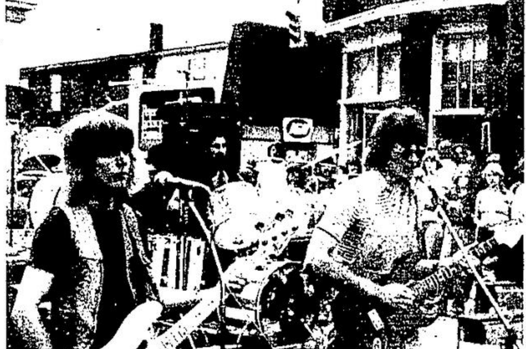
ROCK GROUP FRID played for an enthusiastic crowd at the Back to Acton Days celebration, July 1. A crowd, consisting mostly of young people, lined the streets to hear the group play as part of the Back to Acton Days activities.