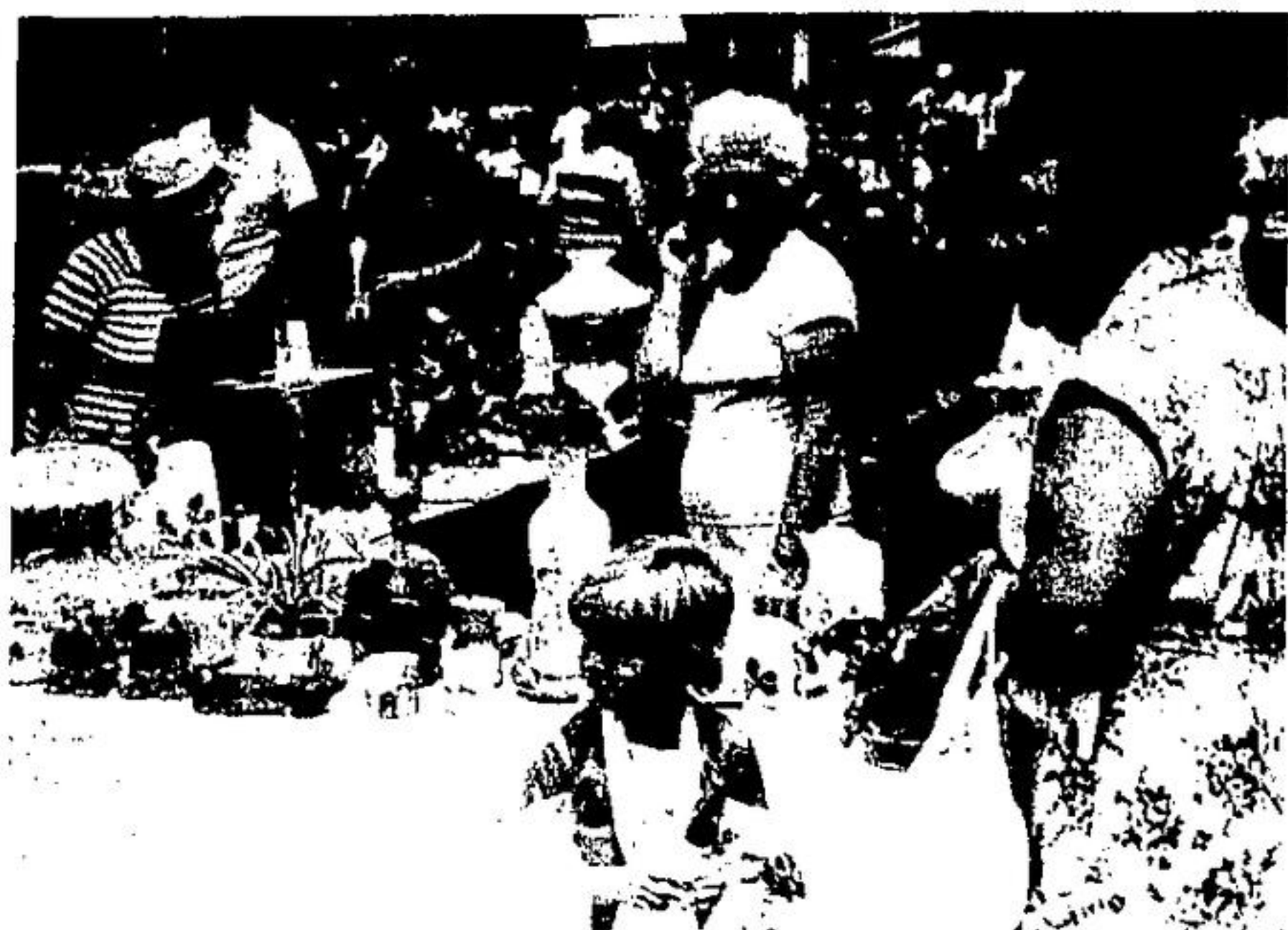
SEVERAL BOOTHS were set up and drew interested customers on Canada Day at Ballinafad.