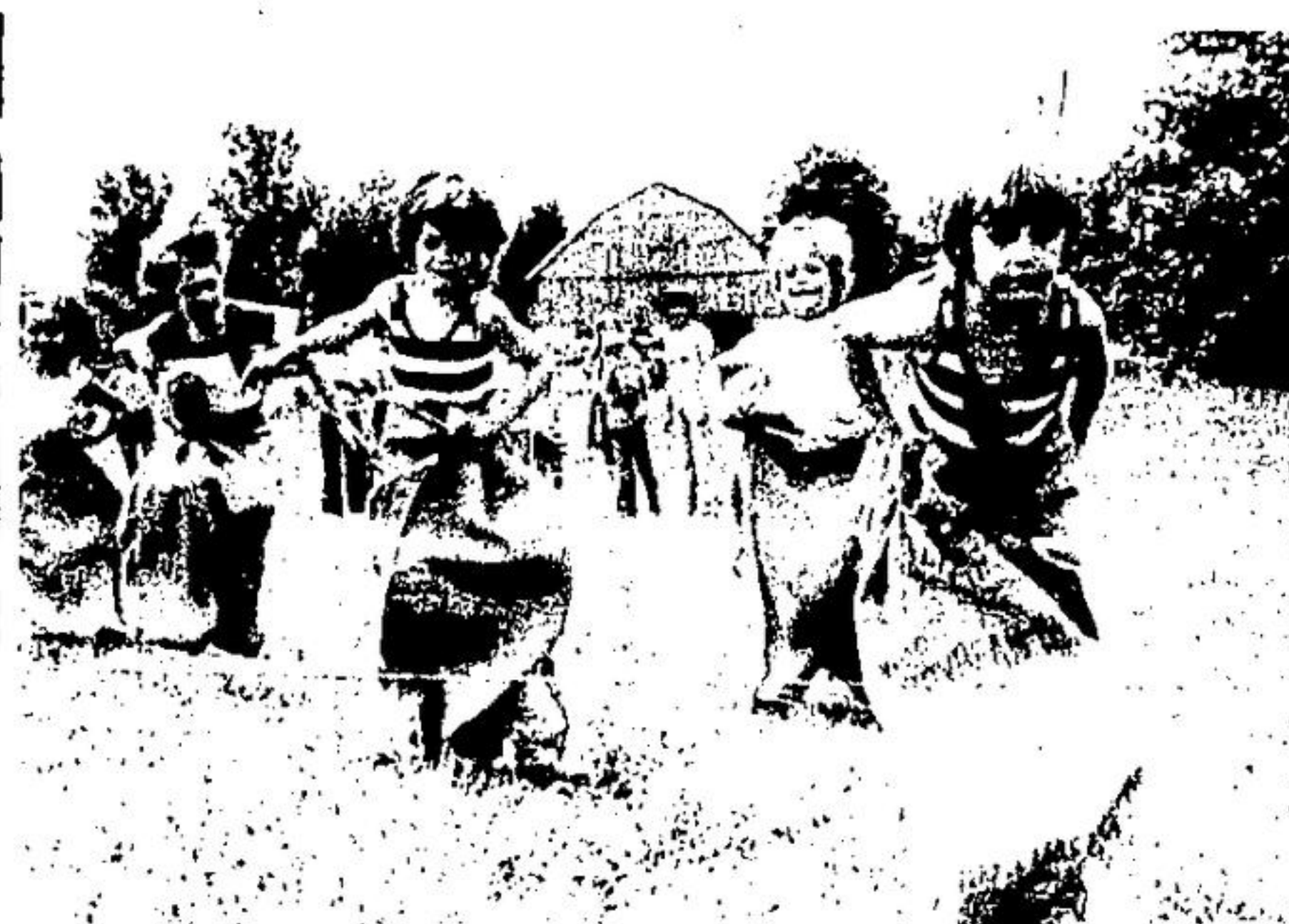
BOYS IN bag race at Ballinafad spurt to the finish line Saturday.