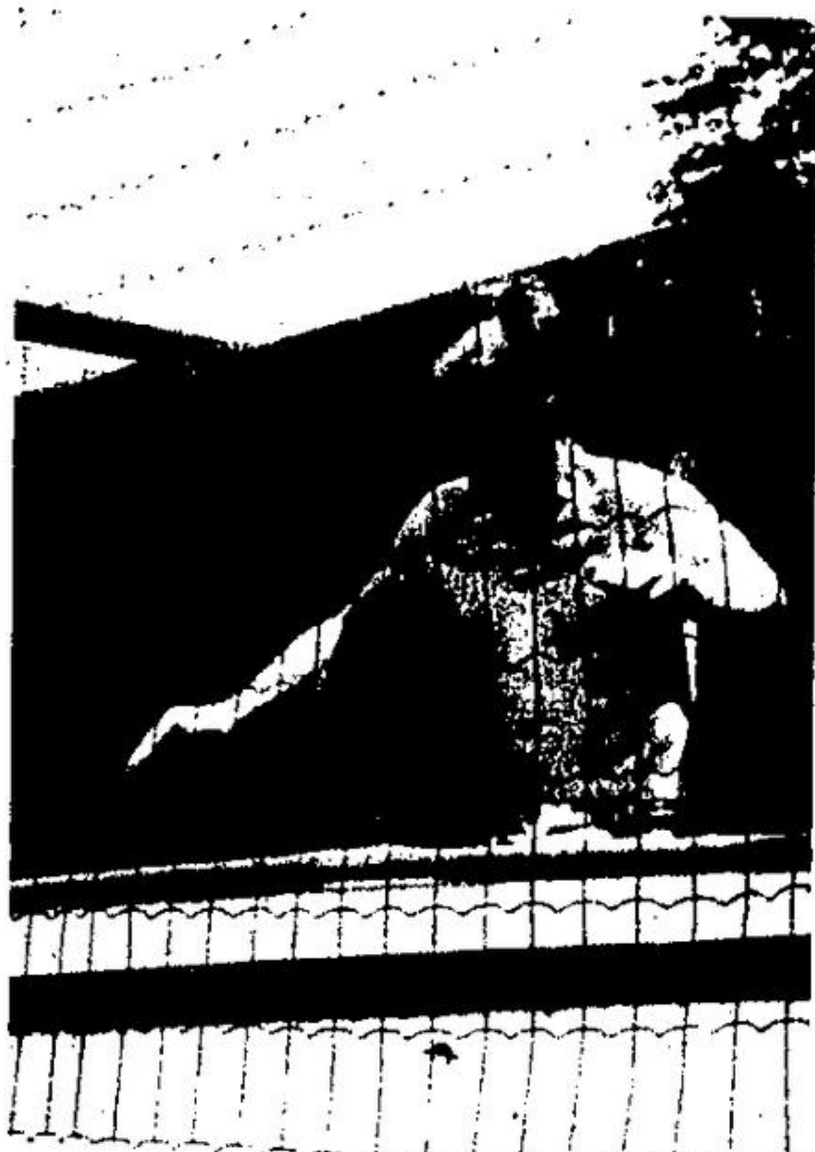
IVAN BIRD hits the water at Ballinafad on Saturday.

Five cartoon-faced watches in plastic cases were reported stolen from the Royal Variety store on Queen Street last week. Shoplifters are suspected.