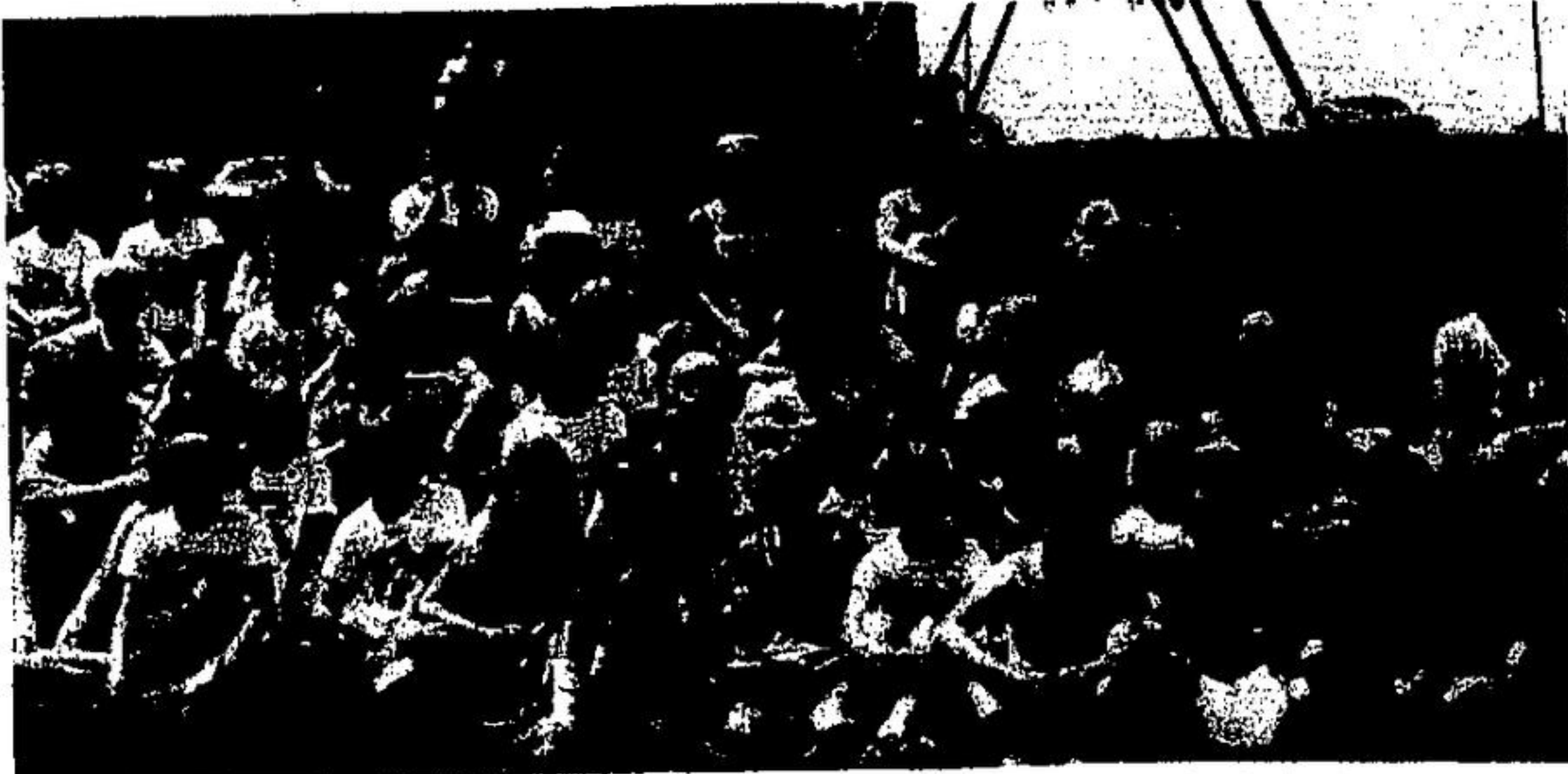
ROBERT LITTLE TRACK team took top honors in the North Halton Junior Track and Field Meet held last week at McKenzie-Smith. They amassed 57 points to get the prize over five other