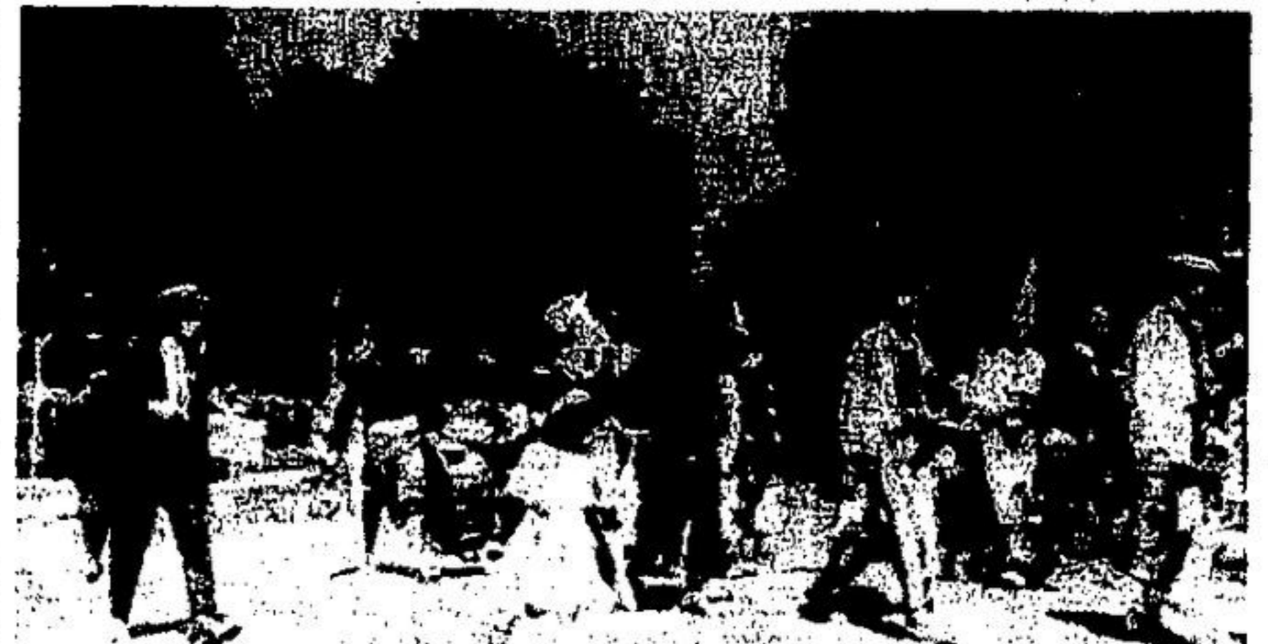
CLOWN BAND always took part. G. A. Dills is the tall lean one in the striped pants.