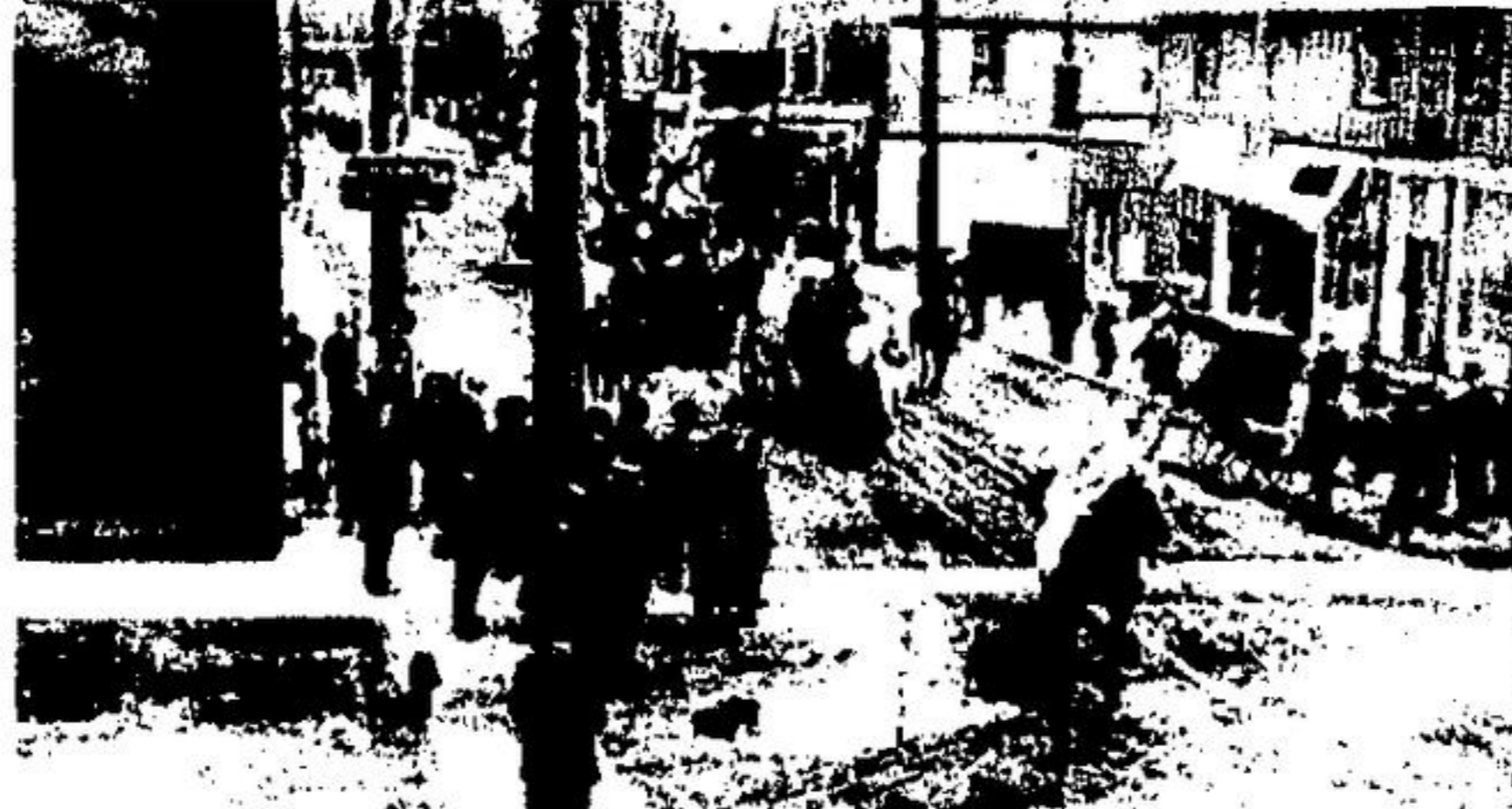
MILL-MAIN corner was always a good place to take pictures of parades. About 1898.