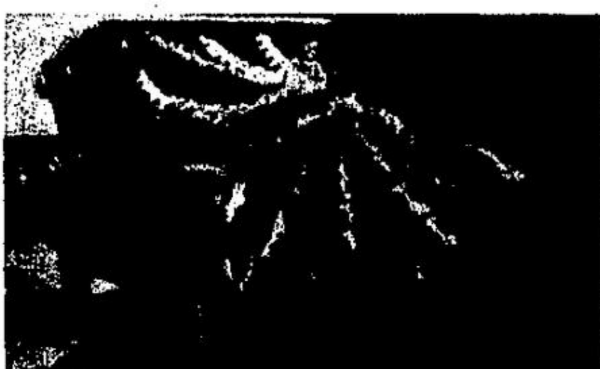
DECORATED CARS added to the excitement and color of the annual Calithumpian parade which was held on the July 1 holiday weekend years ago in town. The car in this old photograph belonged to Grace Lantz's father.

Being our last meeting until September, let's all get out and enjoy the evening and each other's company. See you all on June 27.