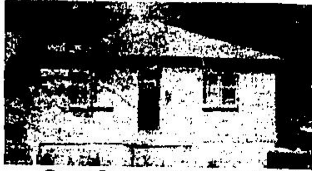
Great Starter Home $42,900

3 bedrooms, living room, kitchen, good size lot located in Village of Glen Williams. Call Rozetta.