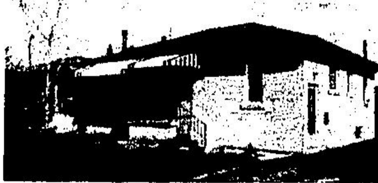
155 Prince Charles $58,900

3 bedrooms, living room, kitchen, good size lot located in Village of Glen Williams. Call Rozetta.