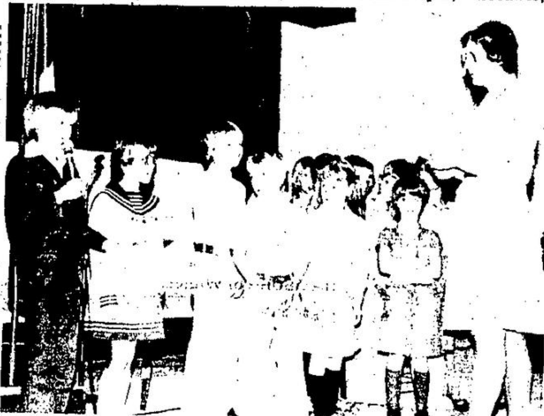
SUNDAY SCHOOL Choir of Bethel Christian Reformed Church sang some songs for their church's 25th anniversary.

Each visiting minister took part in special church services on Sunday. The church was completely filled each time.