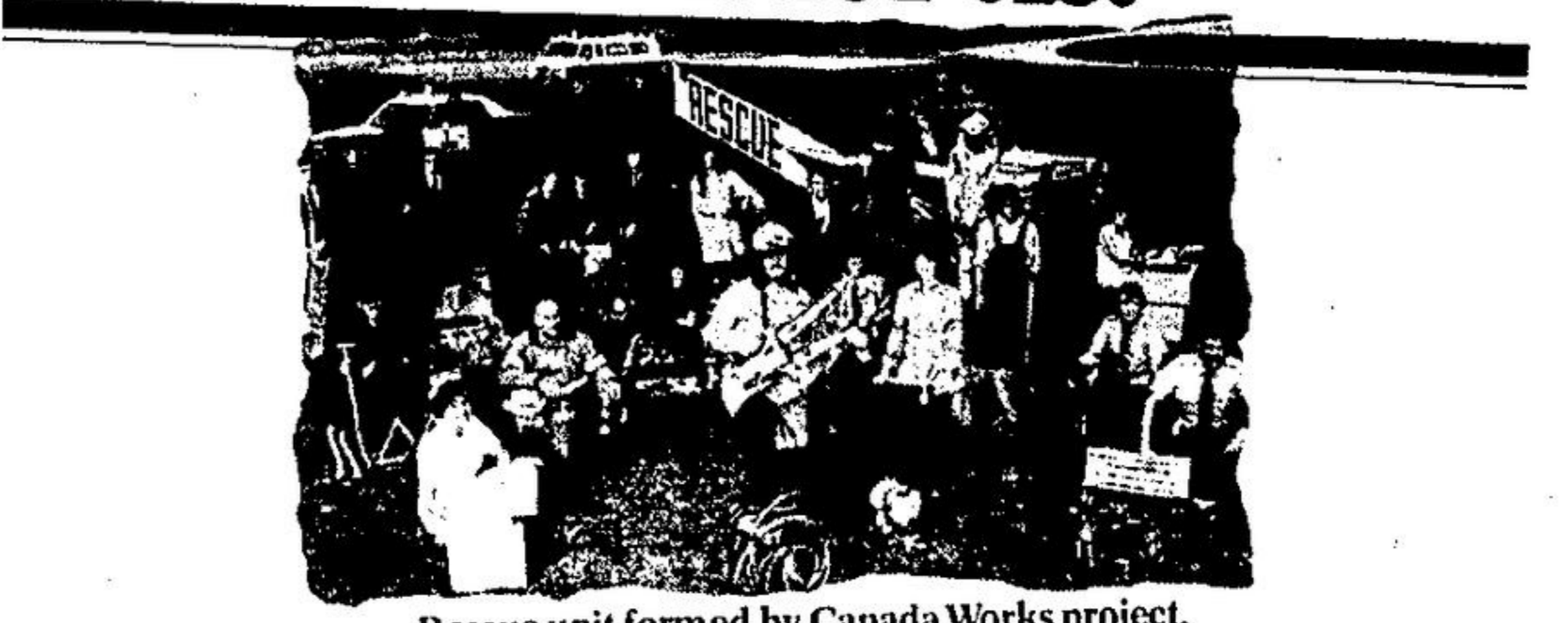
Rescue unit formed by Canada Works project.