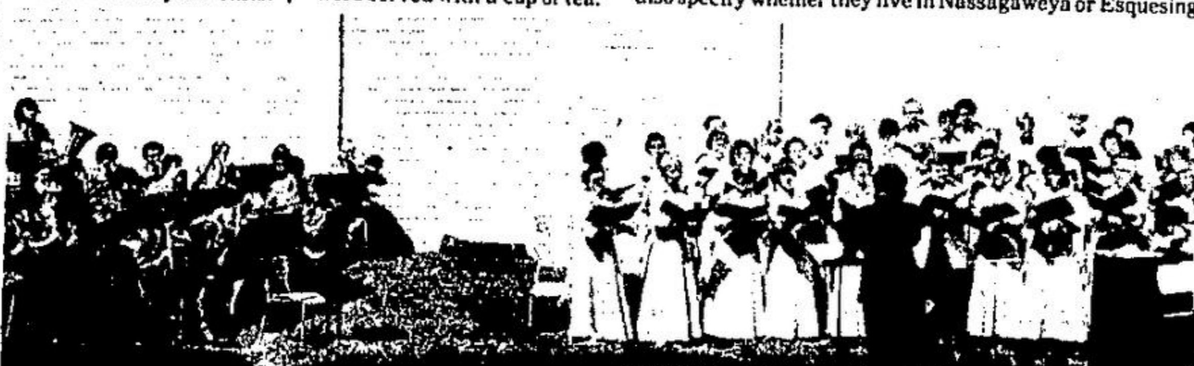
ACTON CITIZENS' BAND and Georgetown Choral Society drew a large crowd to their Summerfest concert in Georgetown Saturday.

Those living in the rural areas, when reporting a fire, should state to the dispatcher the line or sideroad they live on, and between which line or sideroad they live. They should also specify whether they live in Nassagaweya or Esquising.