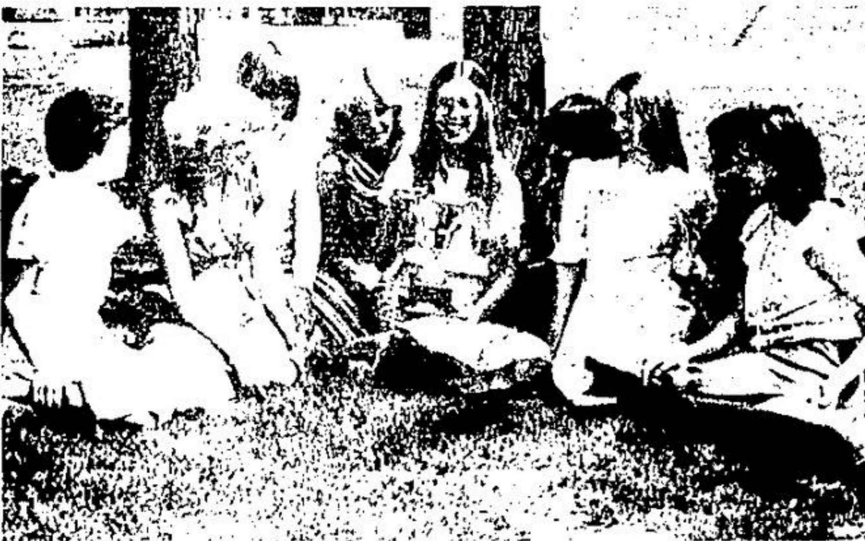
WINNERS IN THE TRIPLE trio category were girls from Georgetown Christian School. Some of the girls are Acton residents but attend the Christian school. Georgetown Christian took three firsts at the festival.