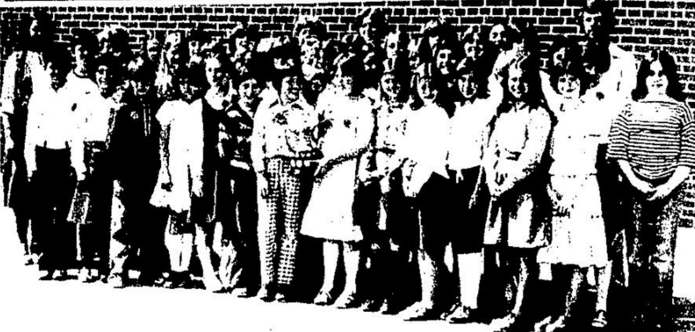
MCKENZIE-SMITH took first place in the Intermediate choir division at the music festival. Singing Pussy Willows, Cat-tails and a song of their choice the group took their second trophy of the day.