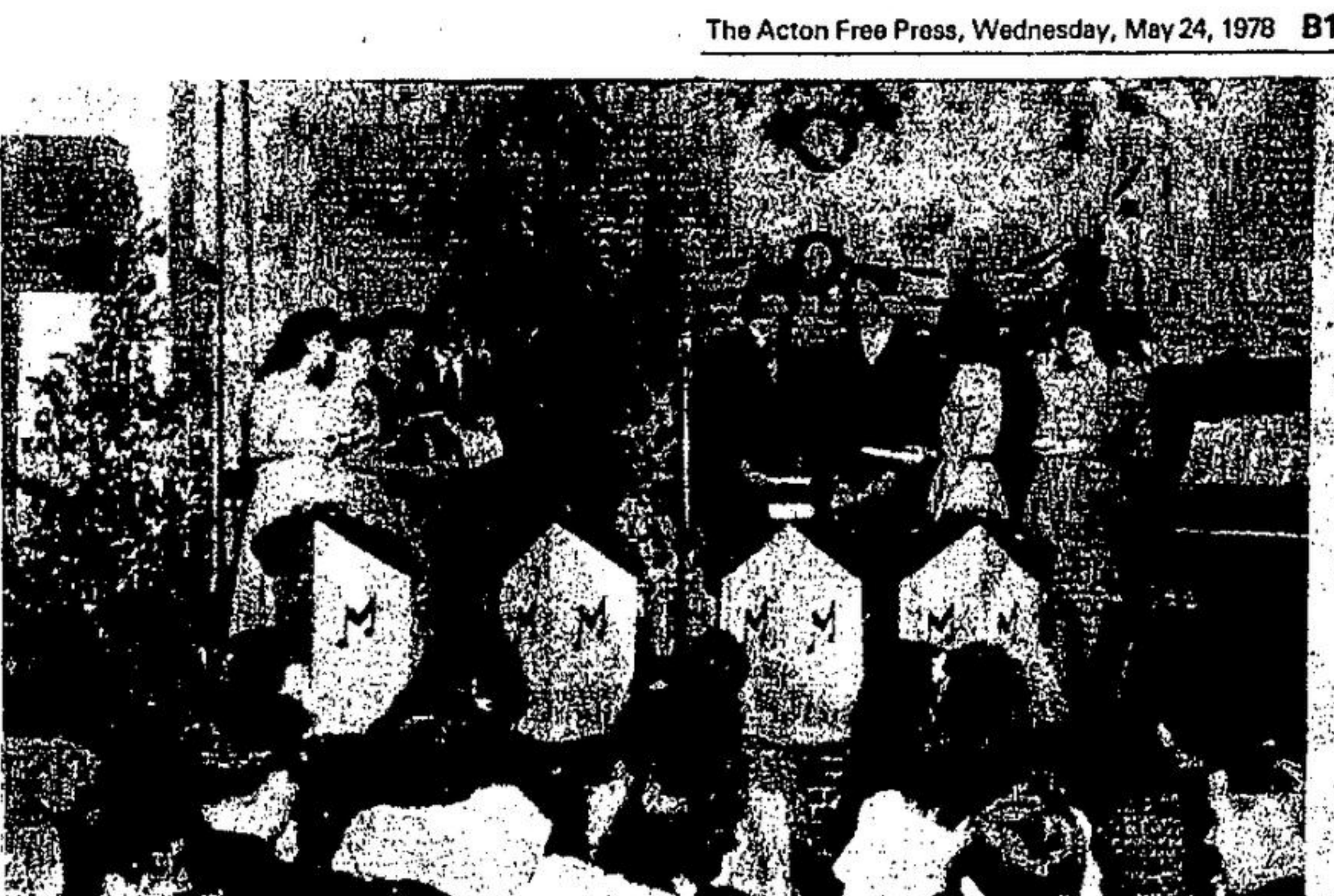
AT HOME in the town hall in 1946 including presentation of certificates to members of the graduating class. Included in the group are